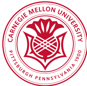
1-color version smaller than 2 inches

If the 1-color seal is used two inches or greater in diameter, Carnegie Mellon University appears in a bolder weight.