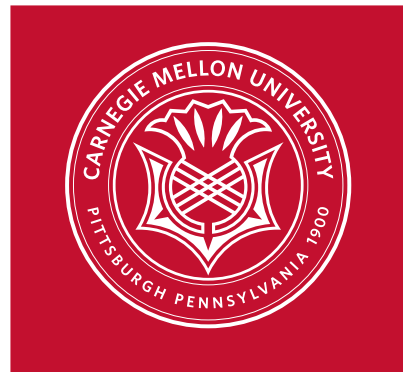
White version reversed out of a background

When reversing the seal out of a background, do not use the 1-color (black) version; always use the reversed (white) version. The seal should only be reversed out in white on red (PMS 187), black or gray.