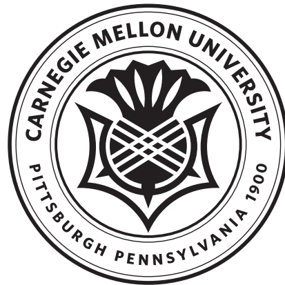
1-color version greater than 2 inches

This is the official seal in full color. Do not alter colors in any way.