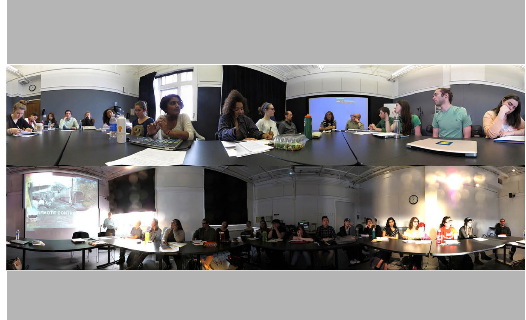
Top: Class in session spring 2015 Bottom: Class in session 2016