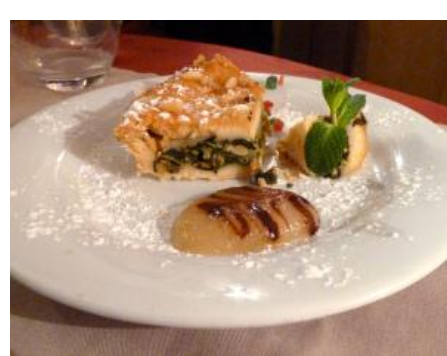
La tourte de blette

Today I went to La Marché Provençal, an outdoor market in Antibes. I bought an olive tapenade (because the olives are supposed to be especially good here), some butternut squash, Brie cheese, lavender honey, apples and a baguette. I'm planning on making my favorite panini from a café back home: