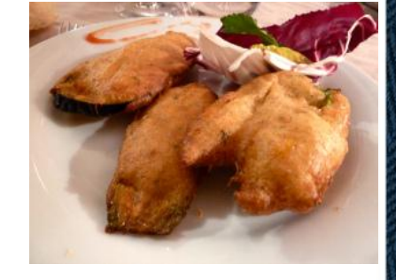
Les beignets d'aubergine

Then came the main dish: lamb and pesto (the French kind is called pistou) pasta with a couple of fancy french fries. It was absolutely delicious, but there was so much of it I didn't think I'd be able to eat it all.