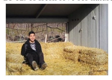
-1 cup of peeled desire to conquer