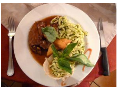
Le gigot d'agneau avec la pate fraîche au pistou

(Lucy Havens, "It's all about the food", cont.)