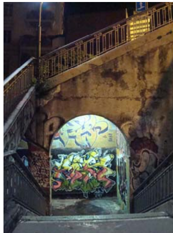
Landscape Category Winner Gwendolyn Barr, Switzerland