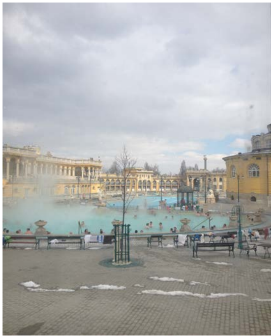
Laura Fleury, Budapest