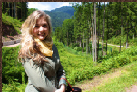
The view of the mountains from Grenoble.

On Sunday on our way home, we went to the Alternitaven Bärenpark, literally a park for bears! Most of them were older bears that had been rescued from the circus so that they could live out the rest of their lives peacefully. There is also a section in the park for bears and wolves so that some of the younger bears can experience some competition for food like they actually would in the wild. It was a beautiful day, and a nice relaxing way to end the weekend.