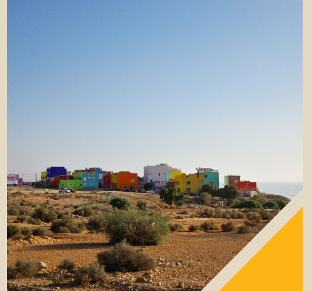
ARES KAPOOR (DC '25), TAGHAZOUT, MOROCCO

We know what we're thankful for this November: it's all of you and the places you'll go!