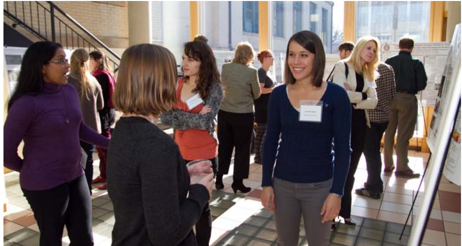
Poster presenters mingle at the 2012 State of the Monongahela.

On November 8, engineers, biologists, and community members gathered at WaterQUEST's third annual State of the Monongahela conference at Carnegie Mellon to discuss the current conditions in the Monongahela River. The conference featured a series of presentations on the latest water quality data, watershed health, and developments in cooperative management of the river.