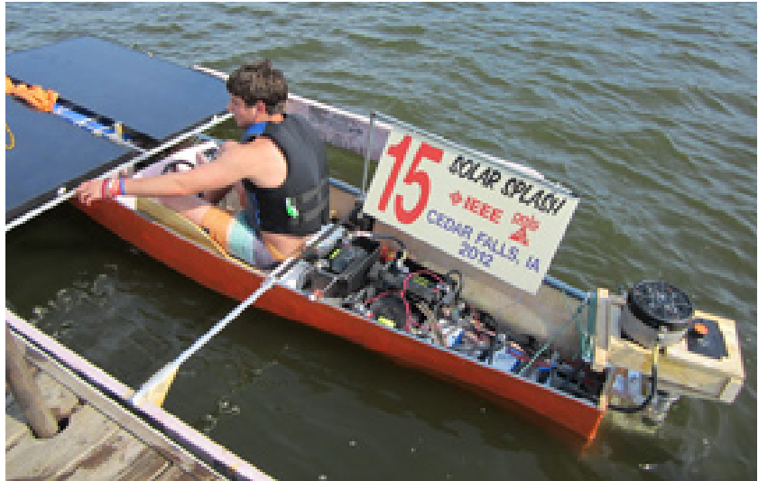
CMU Solar Splash entry in the 2012 Solar Splash competition in Cedar Falls, Iowa.