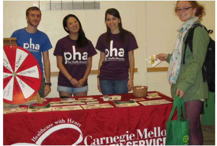
Peer Health Advocates educate about “Meatless Mondays” during Campus Sustainability Day activities.

On October 24 th , Carnegie Mellon University participated in the 10 th annual Campus Sustainability Day and national Food Day celebrations. Campus Sustainability Day is an event promoted by the Association for the Advancement of Sustainability in Higher Education, focusing on campus sustainability accomplishments and encouraging efforts towards greening college and University campuses. “Food Day”, created by the Center for Science in the Public Interest, is powered by a diverse coalition of food movement leaders, organizations and people from all walks of life and takes place annually on October 24 to address issues as varied as health and nutrition, hunger, agricultural policy, animal welfare and farm worker justice.