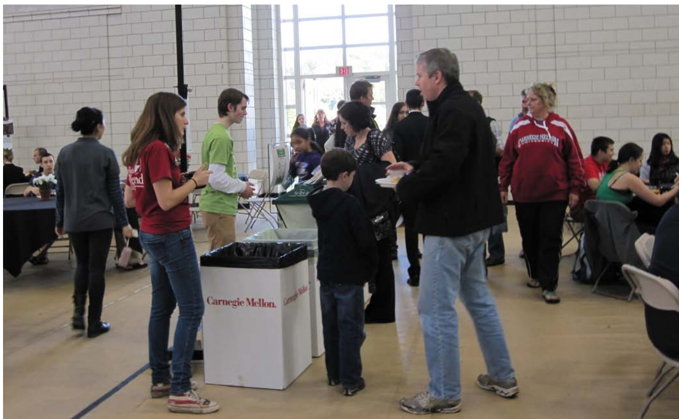
Eco-Reps provide composting instruction during the Cèilidh Tailgate party, Saturday, October 5, 2012.

Carnegie Mellon celebrated the annual Cèilidh weekend October 4-7. Cèilidh [ka-le] a Scottish Gaelic term meaning “visit,” celebrates the annual return of alumni, family and friends to campus with tours, sporting events and many other family friendly activities! One of the most popular activities during Cèilidh festivities is the Tailgate Party and the Carnegie Clan Chili Cook-Off held in Wiegand Gymnasium. This year with support from the Steinbrenner Institute and the Office of Alumni Relations & Annual Giving and the assistance of Green Practices, Eco-Reps and Sustainable Earth, both the Tailgate Party and Chili Cook-Off were near zero waste events! Compostable, recyclable and reusable items were swapped in place of the plastic and paper items that have been used in years past. We collected approximately 20 bags of compost and with the help of student volunteers were able to provide on-site education about the importance of waste diversion on the Carnegie Mellon campus.