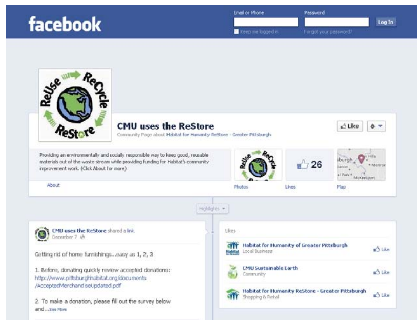
The CMU ReStore Project Facebook page.

Not wanting to compete or overlap with similar efforts by the Habitat for Humanity ReStore or Construction Junction, we have decided to partner with the Habitat ReStore. I've designed a Facebook page ( facebook.com/CMUusestheReStore ) outlining a plan to involve students in discarding and purchasing furniture through the ReStore. Working with the ReStore, we will offer free transportation to and from the ReStore as well as free pick up for discarded furniture. We have put up posters about the ReStore, and we will try some other methods to get the word out as well.