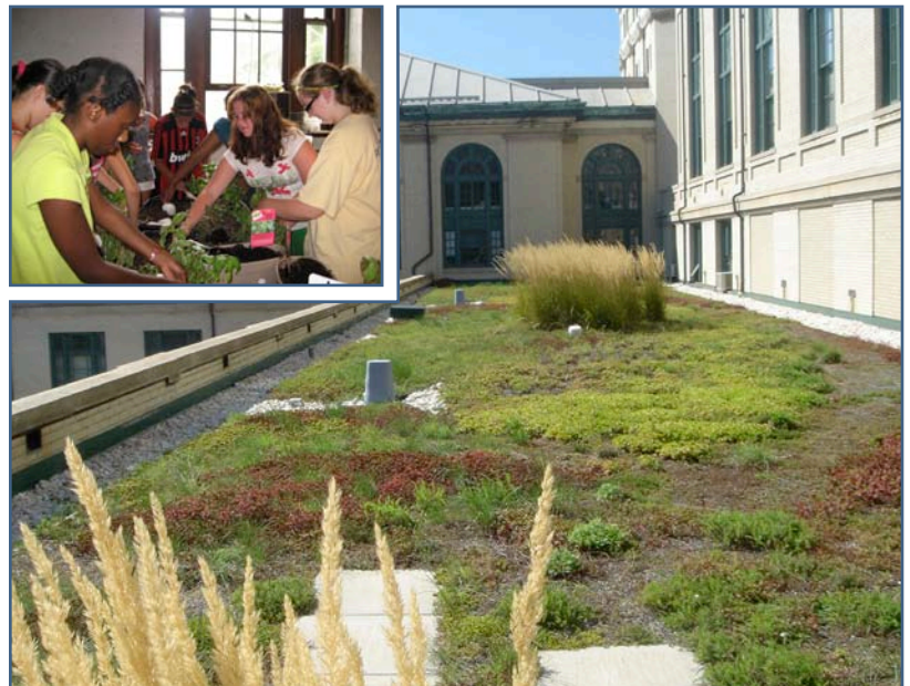
Top left: girls participating in the SEE activity.

After learning about green roofs, each girl was given the opportunity to build her own “green roof.” To do this, we gave each girl a small tray, materials to represent each layer of the green roof, soil, and herbs. Finally, we took them on a tour of the green roofs on the Carnegie Mellon campus.