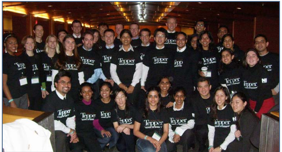
Net Impact members at the 2008 national meeting.