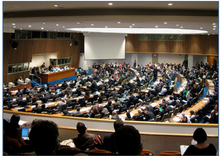
Youth delegates participate at the Commission on Sustainable Development.

Following the United Nations Conference on Environment and Development in Rio de Janeiro, Brazil (also known as the Earth Summit), the United Nations set up the Commission on Sustainable Development (CSD) in December of 1992 to ensure the effective follow-up of the conference at local, national, and international levels. Since its creation, the CSD has had 17 annual conferences to review progress and implementation as well as create policy for local, regional and world-wide sustainable development.