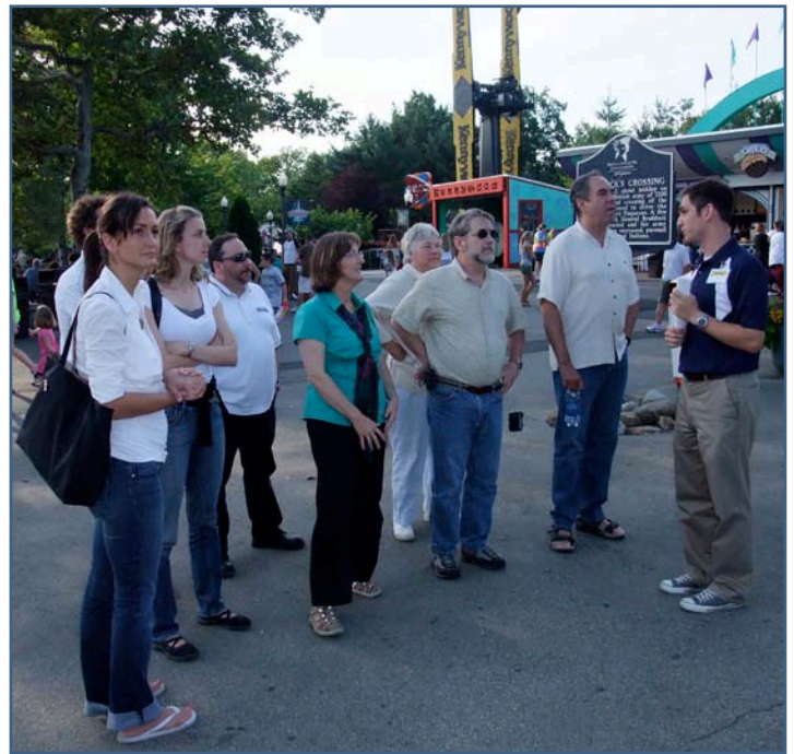
Media Fellows visit Kennywood Amusement Park.