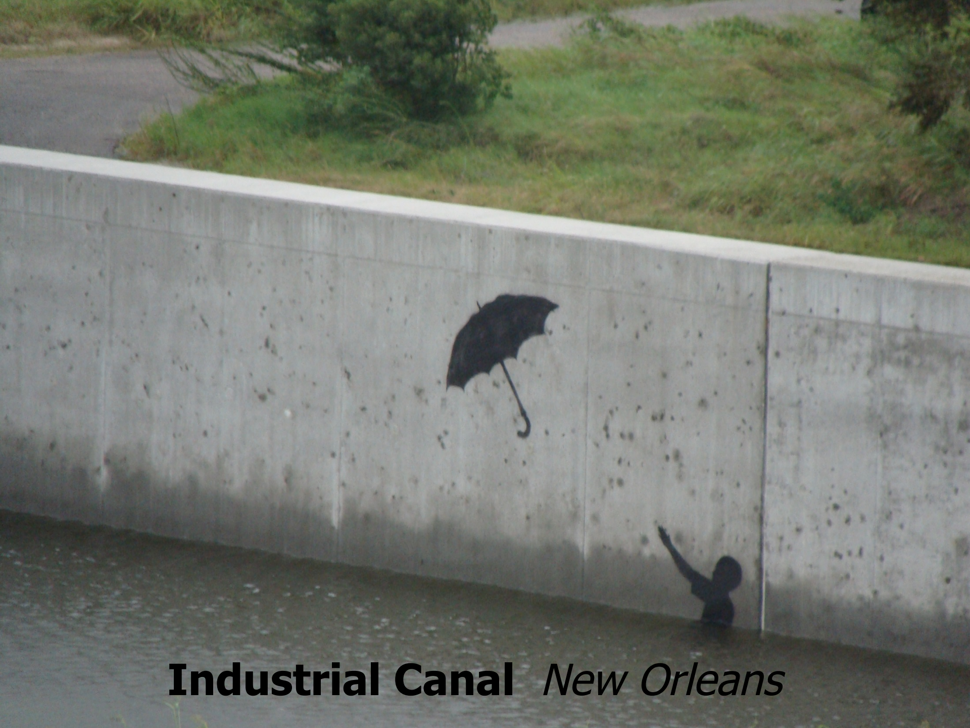
Industrial Canal New Orleans