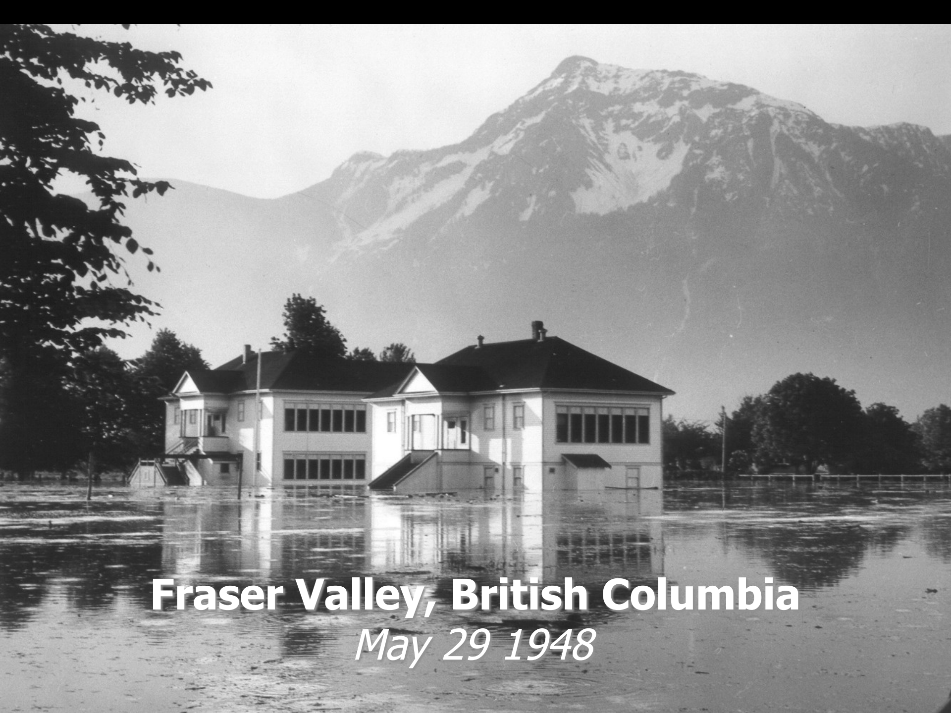
Fraser Valley, British Columbia May 29 1948