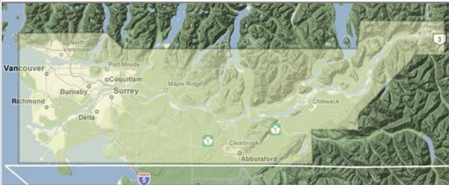
Approximate Area of the Lower Mainland Regional Planning Board