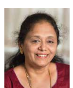
SUMITRA GOPAL ROBOTICS INSTITUTE