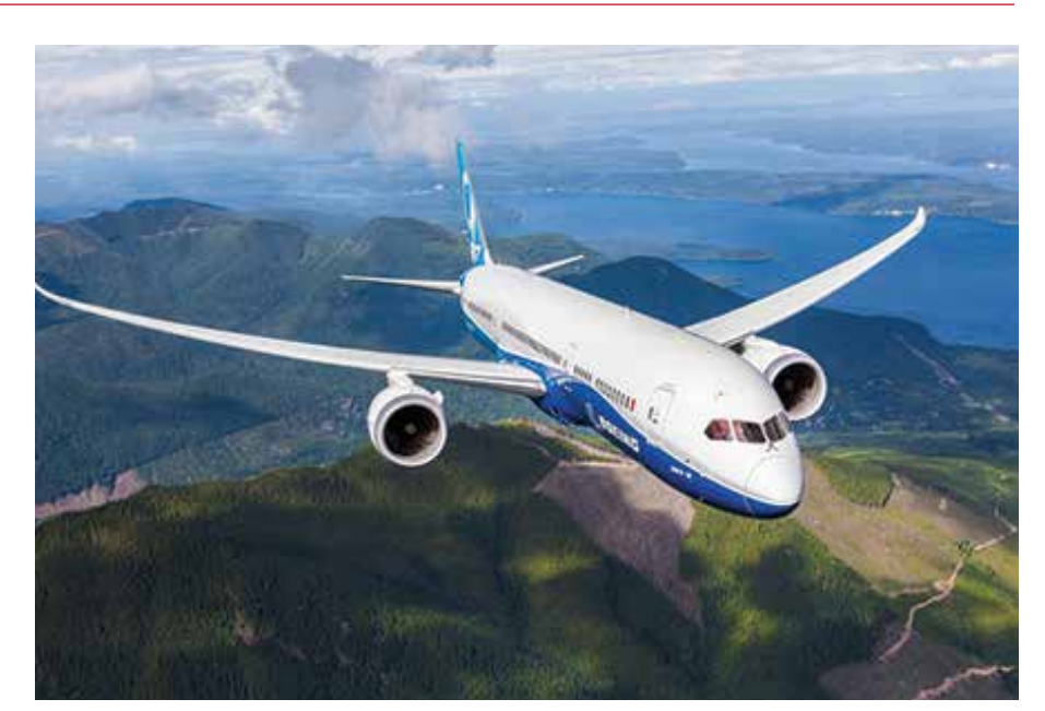
INSIGHTS GLEANED FROM THE NEW BOEING/CARNEGIE MELLON AEROSPACE DATA ANALYTICS LAB COULD LEAD TO SAFER, MORE RELIABLE AND MORE EFFICIENT AIRCRAFT OPERATIONS.

Boeing-directed projects have been identified. CMU anticipates the Boeing lab will involve at least 20 faculty and graduate student researchers.