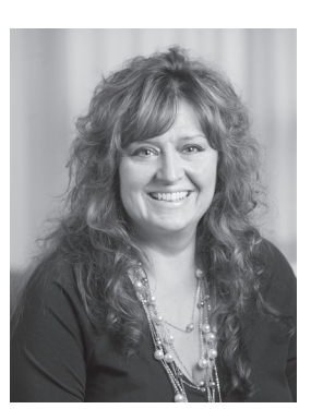
CHRISTINA COWAN INSTITUTE FOR COMPLEX ENGINEERED SYSTEMS