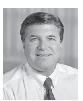
BILL GALL COMPUTER STORE