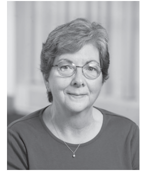
KAREN OLACK SCHOOL OF COMPUTER SCIENCE