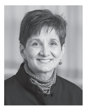
LYNNE LALONE TEPPER SCHOOL