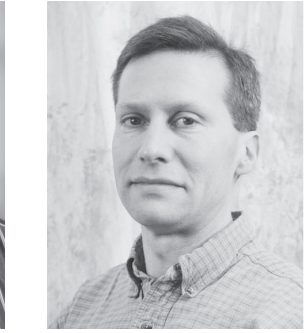
JONATHAN SEWALL HUMAN-COMPUTER INTERACTION INSTITUTE