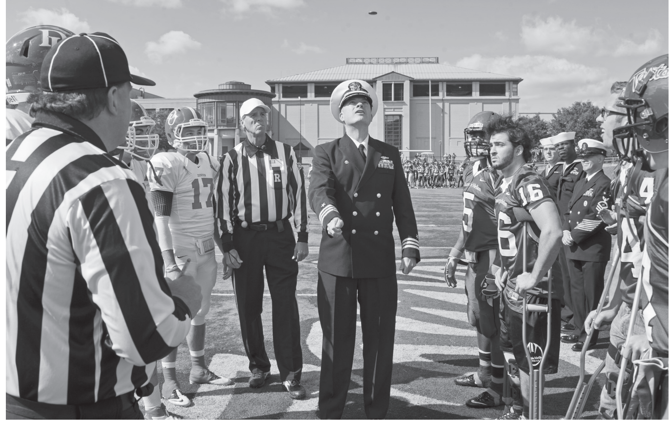
COMMANDER MICHAEL SAVAGEAUX OF THE USS PITTSBURGH TOSSES THE COIN AT THE BEGINNING OF CARNEGIE MELLON'S GAME AGAINST DENISON UNIVERSITY. THE TARTANS DEFEATED THE BIG RED 41-21.

Commissioned in December 1987, the CMU Naval ROTC unit is one of 71 units across the nation. It is led by a staff of six active-duty U.S. Navy and Marine Corps personnel.