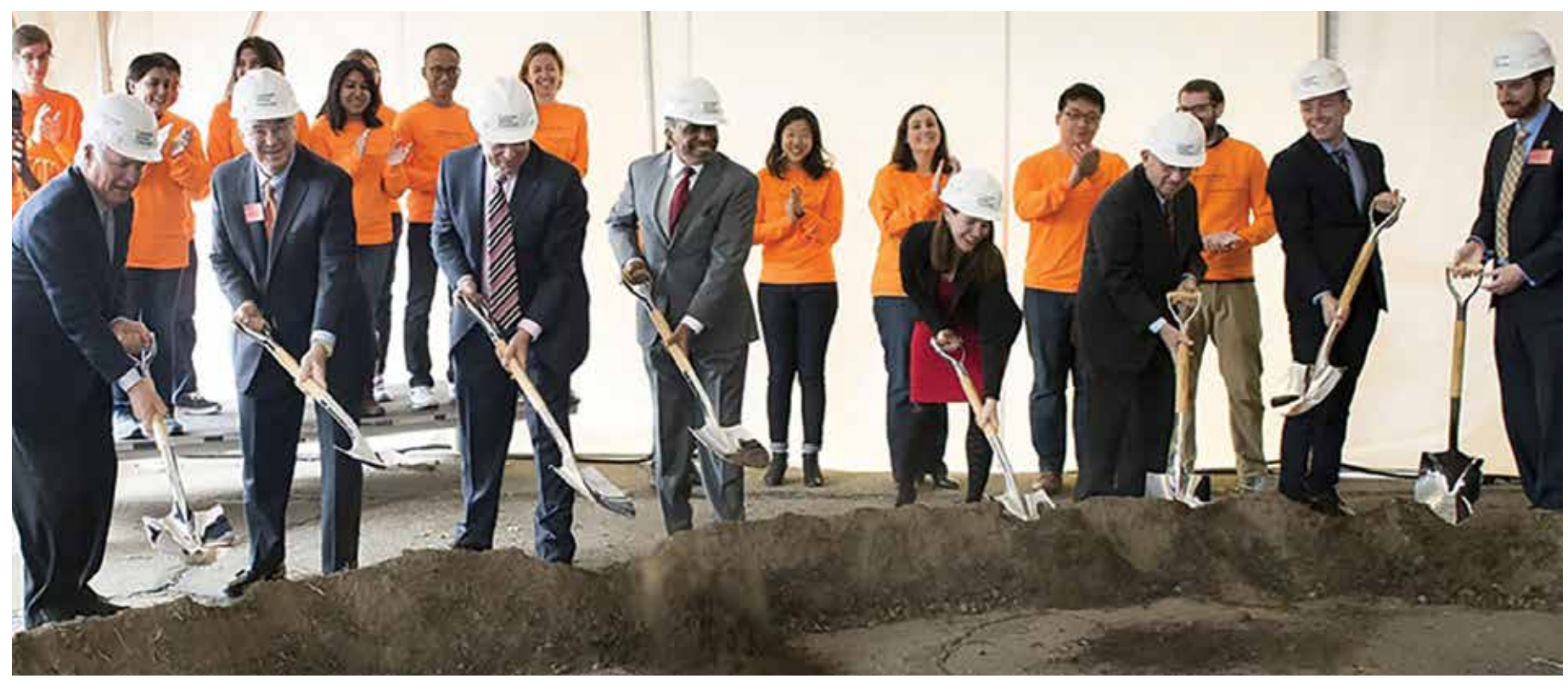
Shovels hit the dirt for the ceremonial groundbreaking.