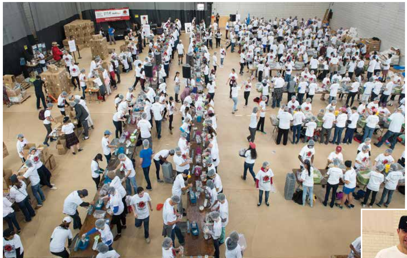
More than 700 students, faculty, staff and family members packaged 125,000 meals for Stop Hunger Now.