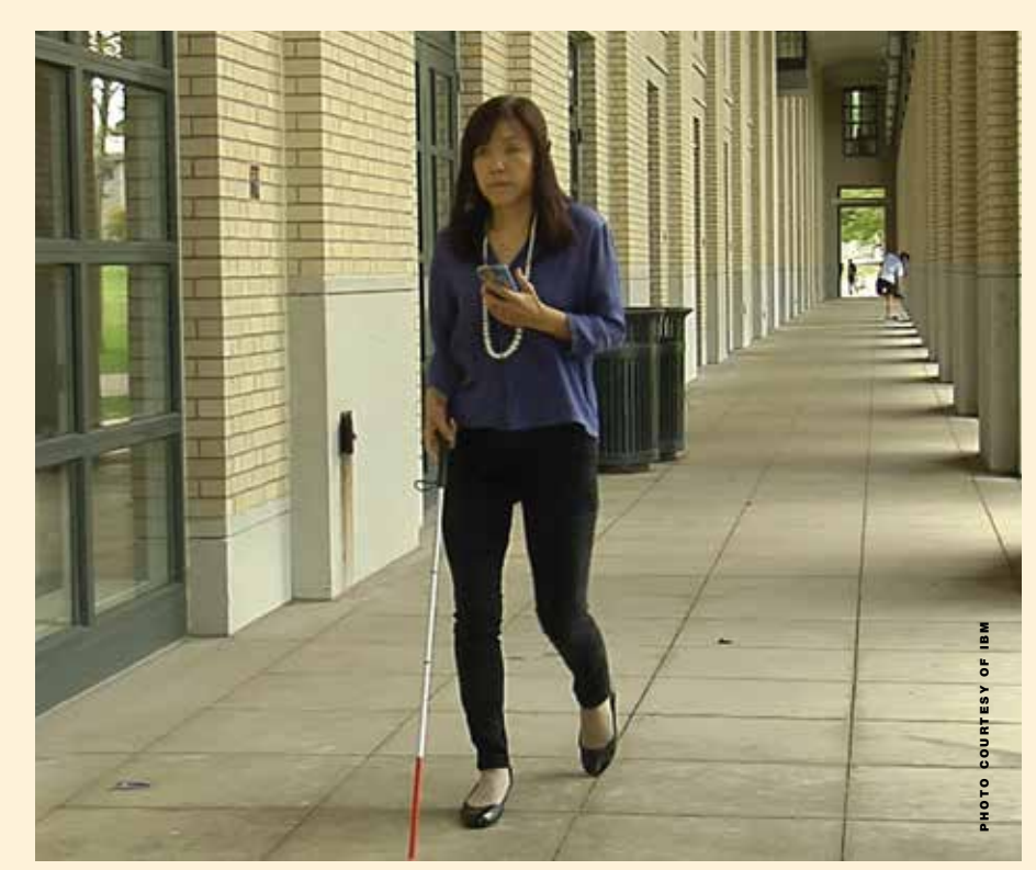
IBM Fellow and visiting CMU faculty member Chieko Asakawa uses a new app for the blind to navigate around campus.

The first set of cognitive assistance tools for developers is now available via the cloud through IBM Bluemix. The open toolkit consists of an app for navigation, a map editing tool and localization algorithms that can help the blind identify in real time where they are, which direction they are facing and additional surrounding environmental information. The computer vision navigation application tool turns smartphone images of the surrounding environment into a 3-D space model to help improve localization and naviga-