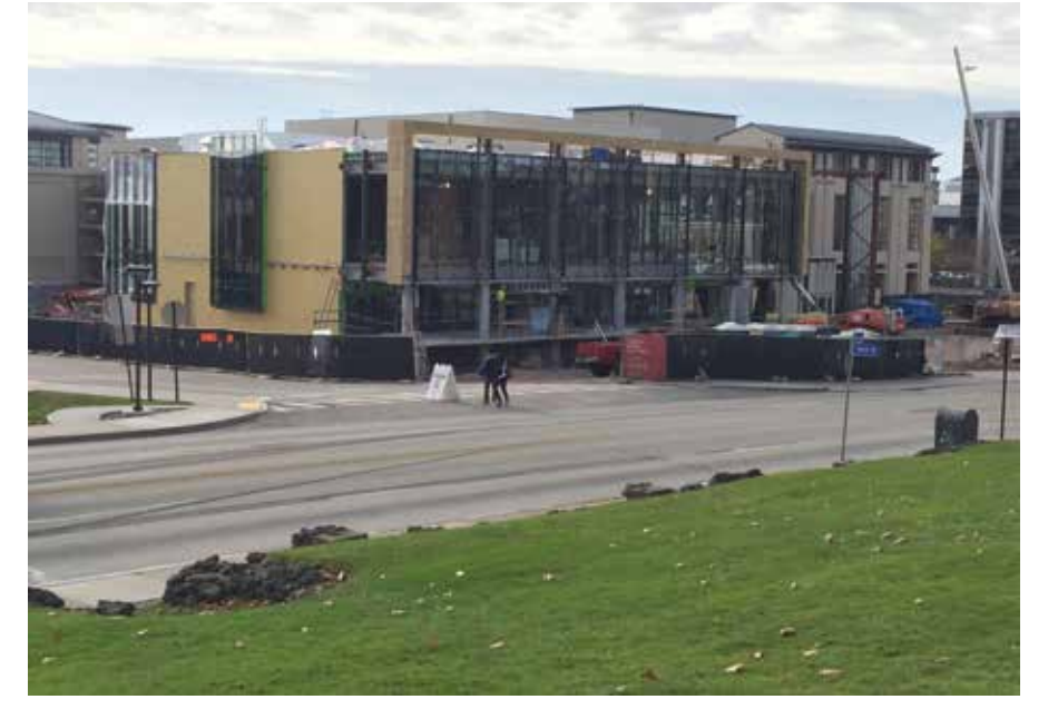
THE COHON CENTER ADDITION WILL BE COMPLETED THIS MAY.

Also nearing completion is the Hamburg Hall renovation project. A new 150-seat auditorium, modeled after Rashid Auditorium in the Hillman Center, has been constructed between Smith and Hamburg halls and an ADAcompliant Forbes Avenue entrance has recently opened. The auditorium was completed for the start of classes this past August.