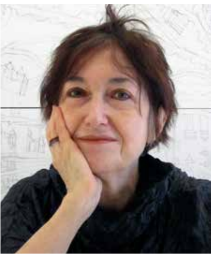
Joyce Kozloff (A'64)

He was named one of the 100 most influential people in the world by TIME magazine in 2013.