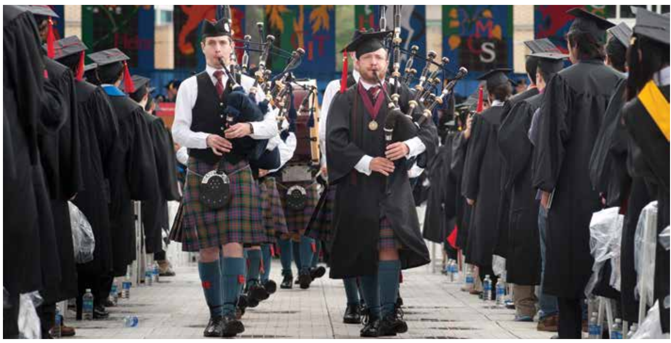
AT COMMENCEMENT, THE CARNEGIE MELLON PIPES AND DRUMS BAND WILL LEAD THE PROCESSION OF FACULTY AND PLATFORM GROUP MEMBERS INTO GESLING STADIUM.