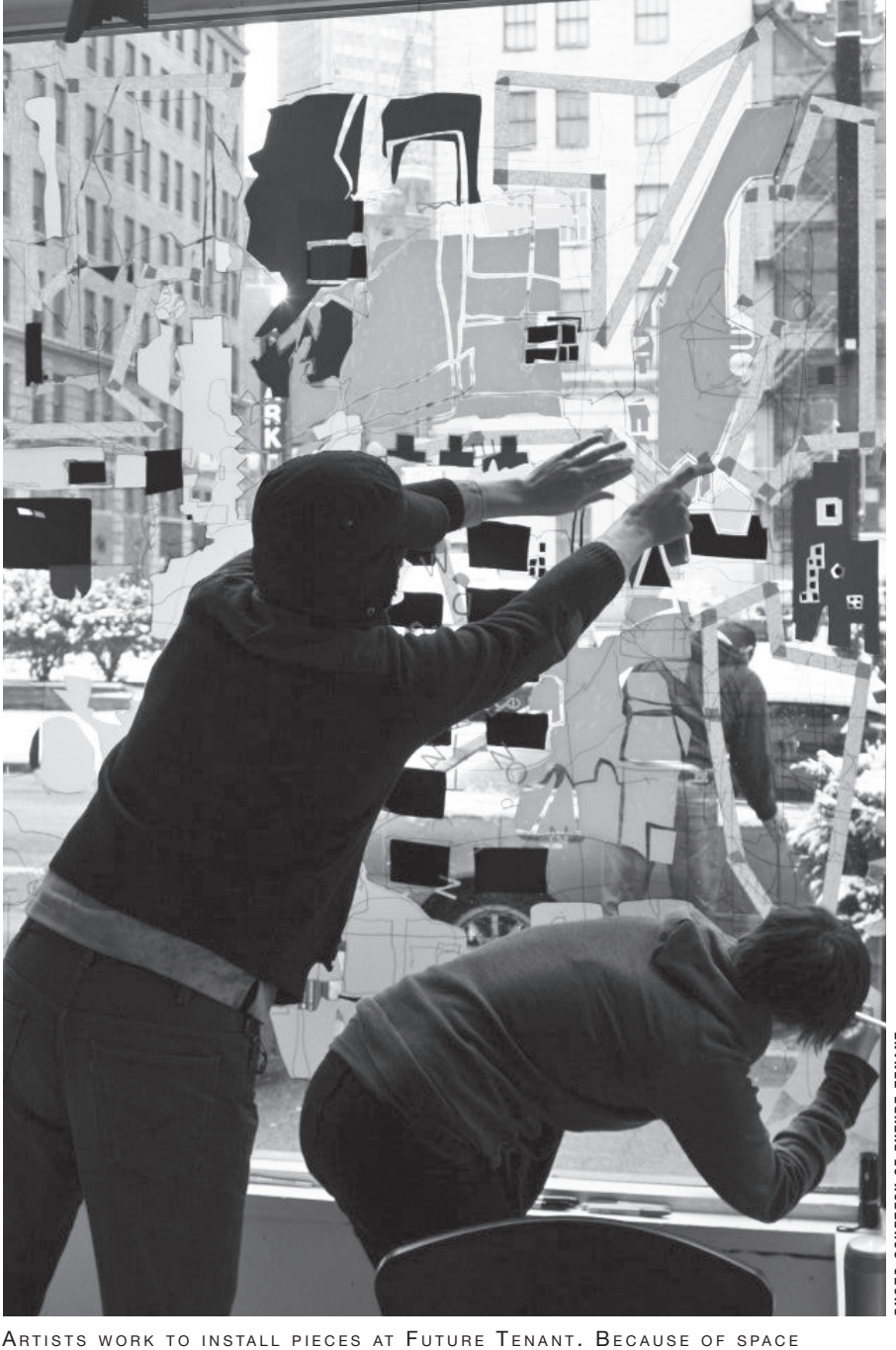
ARTISTS WORK TO INSTALL PIECES AT FUTURE IENANT. BECAUSE OF SPACE CONSTRAINTS, EVERY AVAILABLE SURFACE IS USED FOR ARTWORK, INCLUDING WINDOWS AND THE BATHROOM.

The school is contemplating what Future Tenant 2.0 will look like for the next decade. Part of it will be more collaboration in creative ways between the Future Tenant directors and the school, Goshinski said.