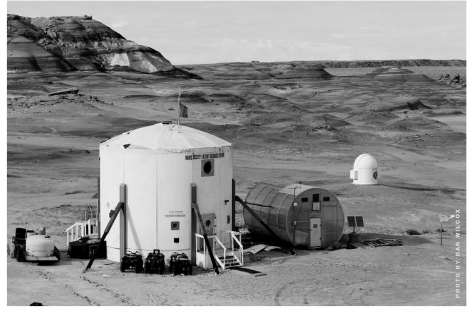
TEAMS OF VOLUNTEERS, INCLUDING THREE FROM CARNEGIE MELLON THIS YEAR, CONDUCT EXPERIMENTS AND EXPLORE THE UTAH DESERT AS PART OF THE MARS DESERT RESEARCH STATION PROGRAM.