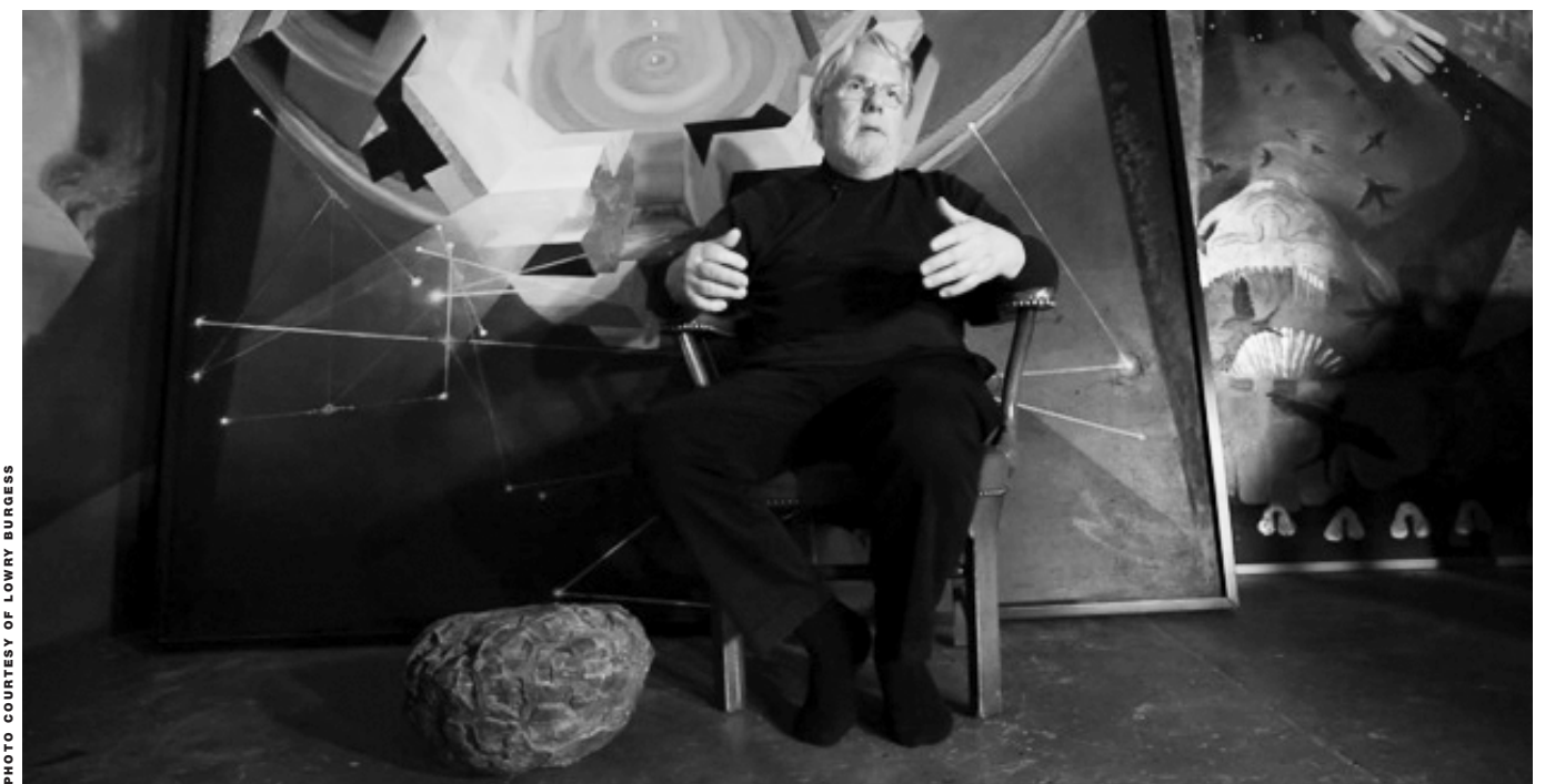
Considered by many to be one of the few pioneers of the burgeoning Space Art movement, Lowry Burgess created the first official art payload taken into outer space on NASA's Shuttle Discovery in 1989.