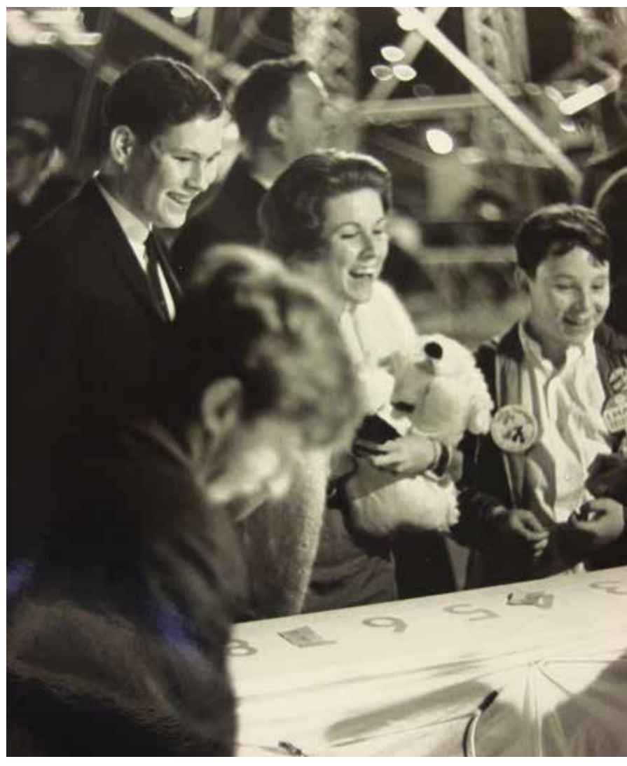
Above: Carnival attendees gather to enjoy a game in the late 1940s. Right: Students in the Scotch'n'Soda Theatre group perform "Miss Stars n Stripes" from the 1963 production.

Queen" was voted on annually for several decades.