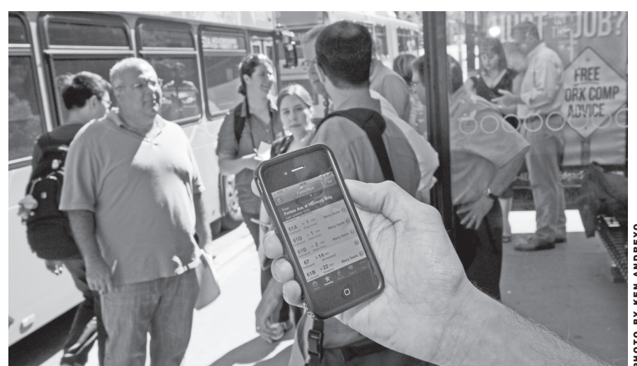
TIRAMISU IS A FREE IPHONE APP FOR PUBLIC TRANSPORTATION RIDERS.

Transit riders in Pittsburgh can now communicate with each other to answer public transportation related questions and share arrival times. Supported in part by CMU's Traffic21 initiative, Tiramisu — literally, Italian for "pick me up" — makes it easy for riders to use their iPhones to signal the location and occupancy level of the Port Authority of Allegheny County bus they are riding, in real-time. Anyone waiting at a bus or T stop with an iPhone can see which buses or light rail vehicles are due to arrive next and, thanks to the signals from riders already aboard, get an idea of how long they have to wait and if there will be a seat available. An Android version will be available for smartphones soon.