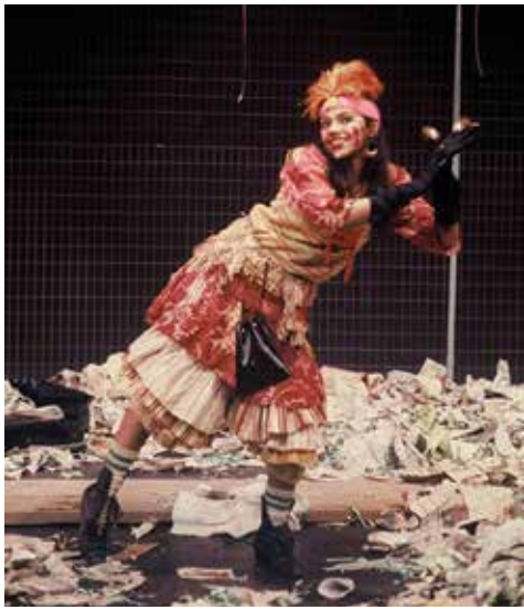
SONIA MANZANO STARRED IN THE ORIGINAL OFF-BROADWAY PRODUCTION OF “GODSPELL,” CREATED BY FELLOW CMU GRADUATE STEPHEN SCHWARTZ.

She auditioned for the role of Maria and went home with the job.