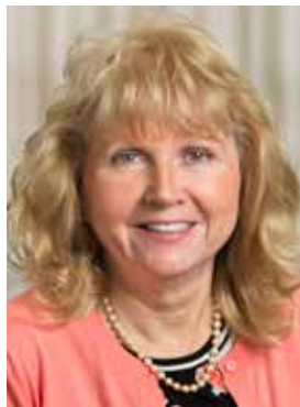
SHARON BLAZEVOICH INSTITUTE FOR SOFTWARE RESEARCH