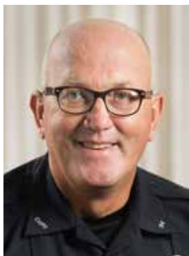
DON CAMPBELL UNIVERSITY POLICE