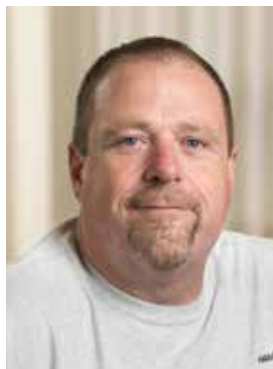
BRUCE GRAFTON FACILITIES MANAGEMENT SERVICES