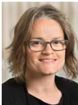
DEBORAH WILT SCHOOL OF DESIGN