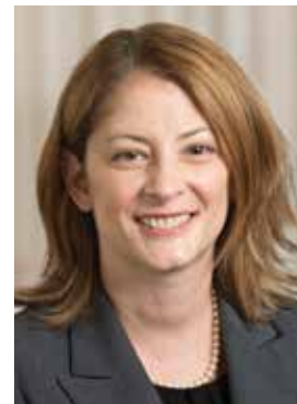
JENNIFER FRICK CAREER AND PROFESSIONAL DEVELOPMENT CENTER