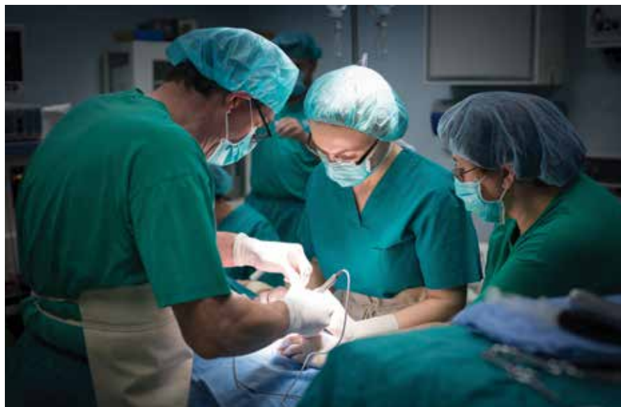
THE TRAINING TOOL PROVIDES FEEDBACK AND ADVICE FOR SURGEONS.

In a recent article published in Technology in Cancer Research & Treatment , Rabin's team demonstrated how its intelligent tutoring approach could shorten the learning curve of surgical residents. The computerized system, which runs about 100 times faster than the actual cryosurgery procedure, uses novel algorithms to create 3-D thermal images of tumors in patients in a variety of scenarios. This allows the trainees to see firsthand the effects of the tissue they are freezing.