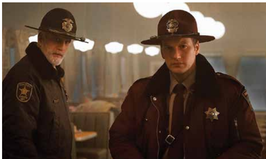
PATRICK WILSON (RIGHT) STARS ON FX'S “FARGO” THIS FALL.

All Subscriber Series performances are at 8 p.m., Tuesday through Friday, and 2 and 8 p.m. on Saturdays in CMU's Purnell Center for the Arts.