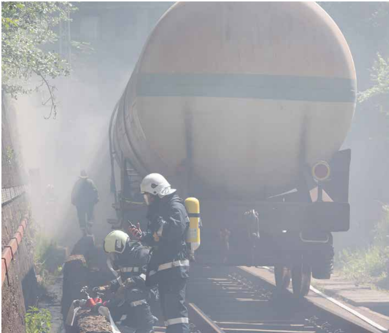
CMU'S ANNUAL EMERGENCY RESPONSE DESKTOP DRILL FEATURED A TRAIN CATCHING ON FIRE UNDER THE BRIDGE NEAR THE ROBERT MEHRABIAN COLLABORATIVE INNOVATION CENTER.

After 15 minutes of planning each group gave an overview of what they discussed and what actions were taken,