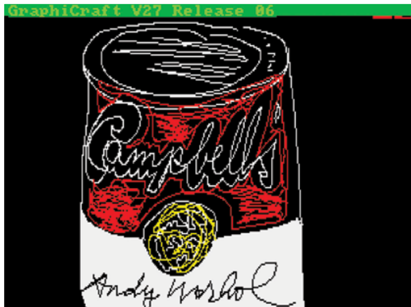
DIGITAL IMAGE, FROM DISK 1998.3.2129.3.22 - CAMPBELL'S SOUP CAN

THE ANDY WARHOL MUSEUM, PITTSBURGH; FOUNDING COLLECTION, CONTRIBUTION THE ANDY WARHOL FOUNDATION FOR THE VISUAL ARTS, INC. (C) 2014 THE ANDY WARHOL FOUNDATION FOR THE VISUAL ARTS, INC. / ARTISTS RIGHTS SOCIETY (ARS), NEW YORK