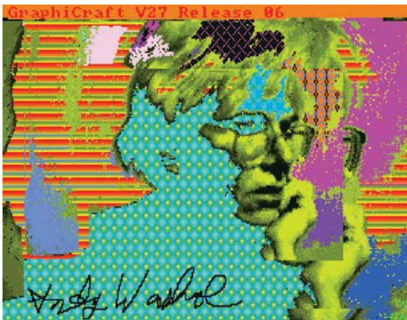
DIGITAL IMAGE, FROM DISK 1998.3.2129.3.4 - A SELF-PORTRAIT