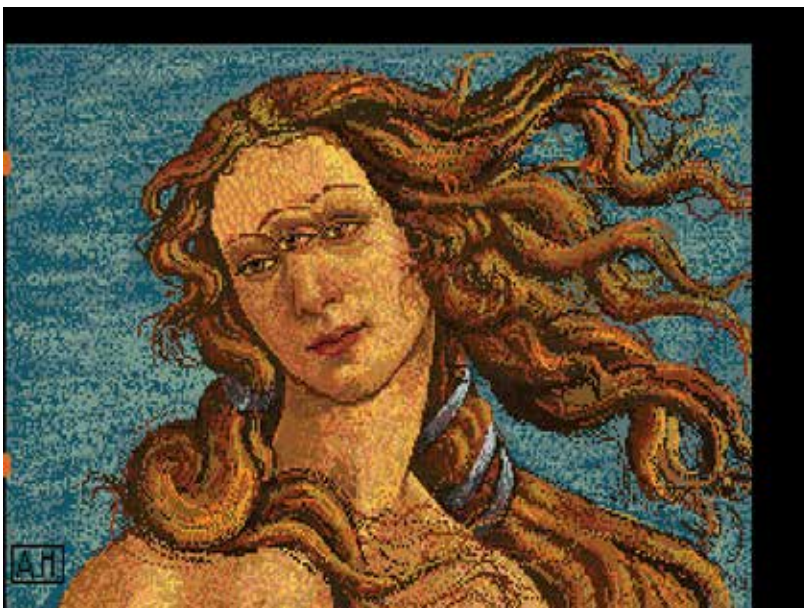
DIGITAL IMAGE, FROM DISK 1998.3.2129.3.22 - BOTTICELLI'S VENUS