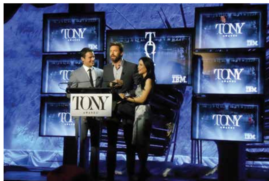
JONATHAN GROFF, HUGH JACKMAN AND LUCY LIU CO-HOSTED THE TONY NOMINATIONS BROADCAST.

Nominations for the "Tony Honor for Excellence in Theatre Education" will be open to the public and accepted starting in September 2014 at tonyawards.com and cmu.edu . A panel of judges comprised of leaders from the American Theatre Wing, The Broadway League, CMU and others from the theatre industry will select the finalists and winner based on criteria set forth by the committee. Demonstrating a positive impact on the lives of students, advancing the theatre profession and