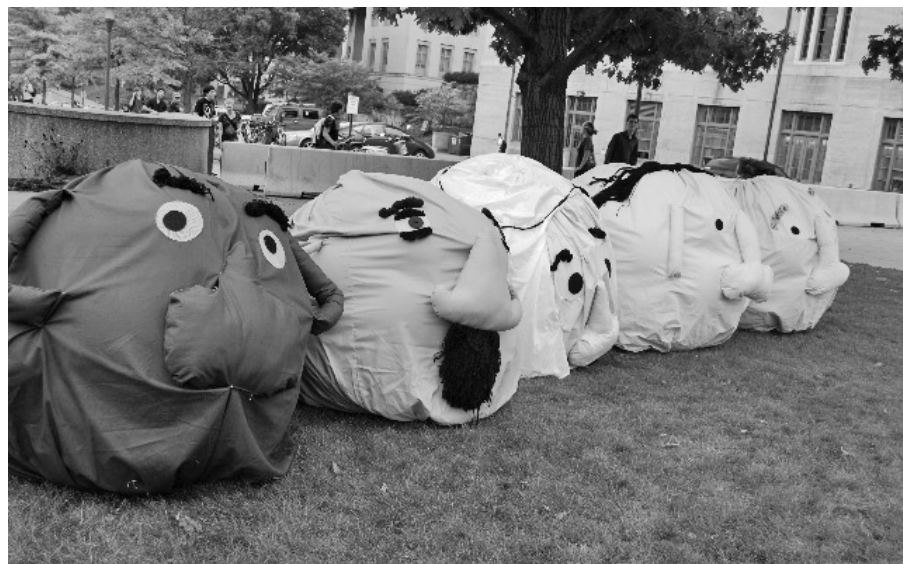
THE ART INSTALLATION “HEADS OF STATE” ROLLED ONTO THE CUT ON THURSDAY, SEPT. 24.