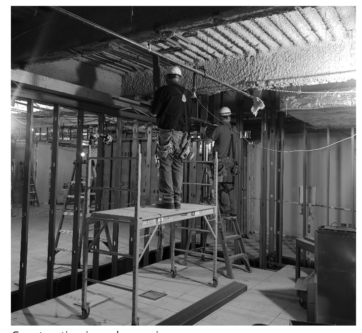
Construction is underway in our new space

We have been impressed with their spirit of cooperation and look forward to a productive working relationship with the Landau team over the coming months.