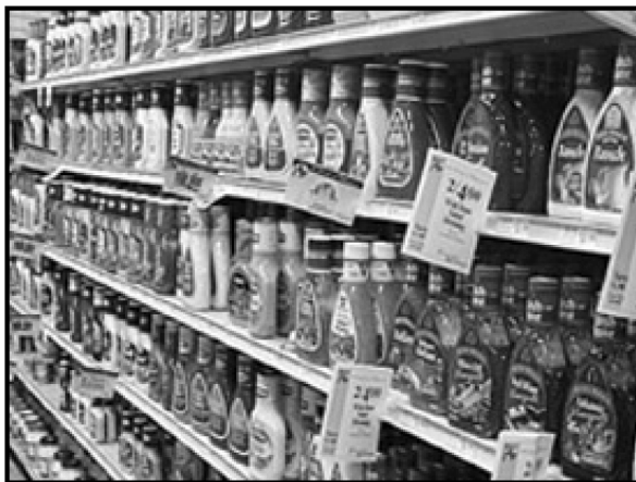
Figure 1. Consumers in developed markets are typically bombarded with a large number of products that have few fundamentally differentiating factors, and hence make decisions based mostly on price, brand, and packaging alone.

Perhaps exemplified by the “tragedy of the commons” 1 (Hardin, 1968), barriers to sustainability may be as much socio-cultural as technological. In a market economy, industrial production of consumer goods and services is driven by patterns of decision-making in the marketplace, a largely socio-cultural activity. However, individuals make these decisions with little or no ability to “rationally” gauge the ultimate social and environmental influence of their choices. For example, the automobile market is directed towards the satisfaction of “private” preferences - size, acceleration, style – as opposed to “public” or social preferences – reduced global warming impacts, air pollution, and resource consumption. We feel there is a fundamental challenge to sustainability in designing an appropriate information system through