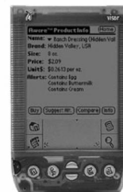
Figure 4c. Scanning a product provides information and alerts for product characteristics that are important to the user. Consumers can also ask Aware to suggest alternative products that score well given the user's criteria.