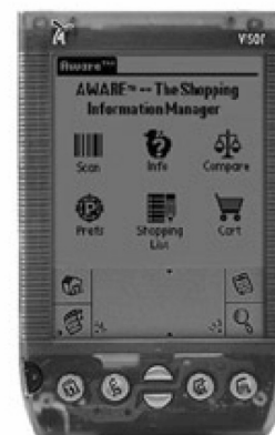
Figure 4a. A Preliminary Aware concept.

Design and development of this concept involves significant challenges. Existing personal digital assistant (PDA) handheld computers, portable UPC barcode scanners, wireless networking technology, and database management software can be utilized to realize Aware. However, significant technical challenges remain in developing a method to display useful, usable, and desirable information appropriately within the capabilities of a handheld computer, developing software to interface with the user and communicate with an online database via wireless connection, developing an appropriate structure for that database, developing a wearable or mounted method for using the device, researching environmental inventories for a set of products, and assessing usability and potential for influencing purchasing decisions. We detail plans for meeting these challenges through collaborations between the principal investigators and student design teams in several cross-disciplinary courses and student organizations in the coming sections.