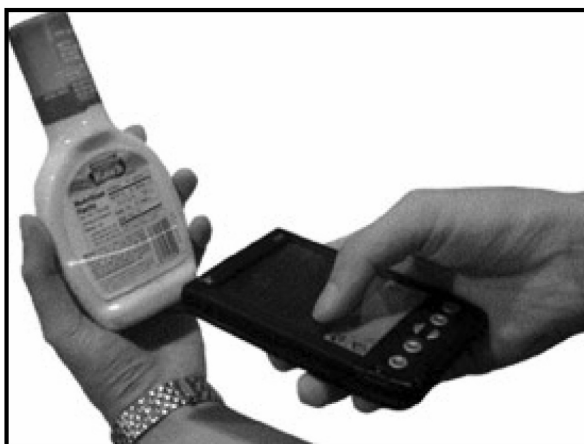
Figure 2. Handheld computers (PDAs) outfitted with UPC barcode scanners could function as an effective means to providing additional information, such as environmental characteristics, to consumers at the point of sale.