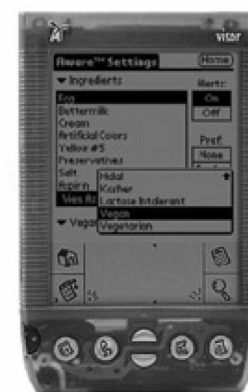
Figure 4b. Each user defines characteristics which are most important for consideration in purchasing decisions.