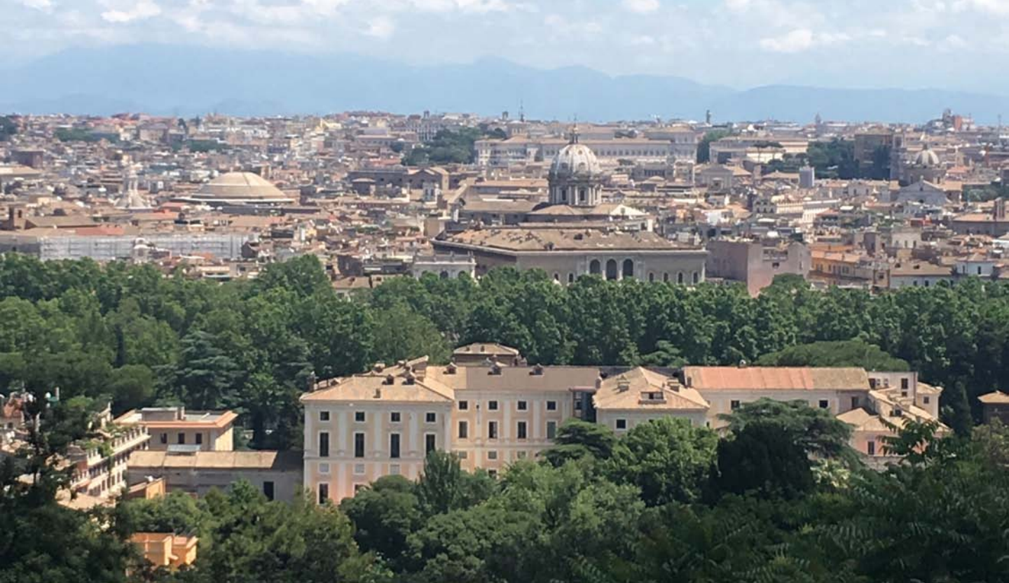
Above: View of Rome