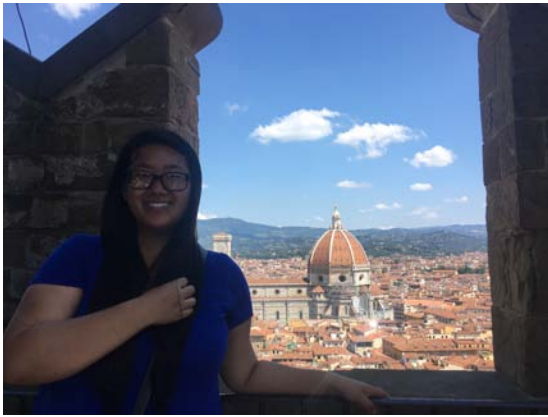
Me in Palazzo Vecchio's tower