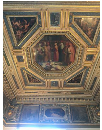
Art inside Palazzo Vecchio