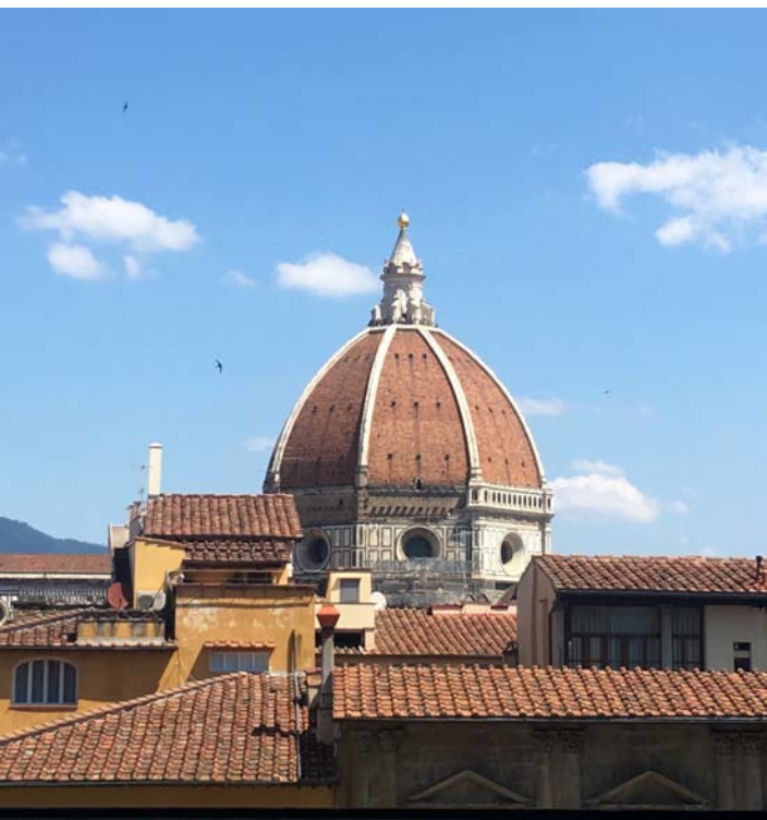
View of Rome