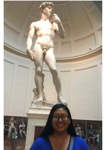
Me and The David

The program I went through had an excursion to Florence. I visited many places and saw famous artworks!