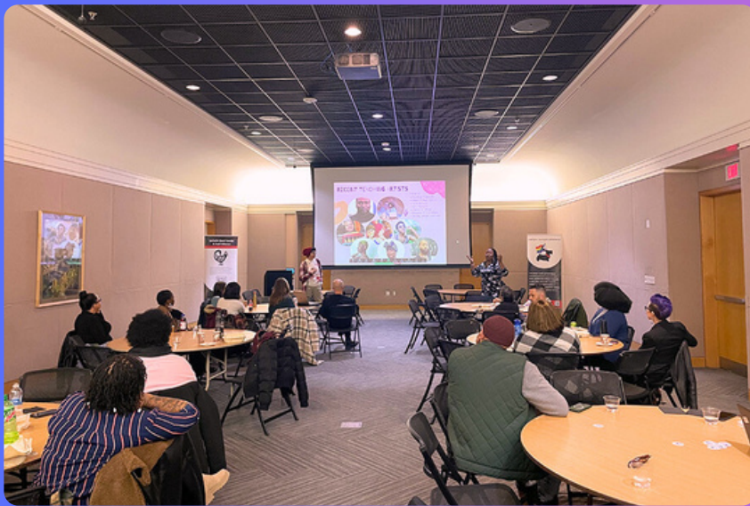
Dreams of Hope presentation on February 20, a collab with Sankofa-Black Faculty and Staff Alliance

CMU'S LGBTQIA+ FACULTY AND STAFF ALLIANCE NEWSLETTER