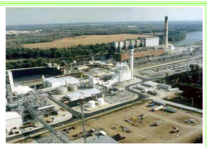
An Coal-to-gas Plant in Indiana

How it Works : Regular coal plants burn coal to make electricity. Coal-to-gas plants turn coal into gas. This gas is burned. Its heat is used to power a type of engine, called a "turbine". This turbine then runs a generator to make electricity.