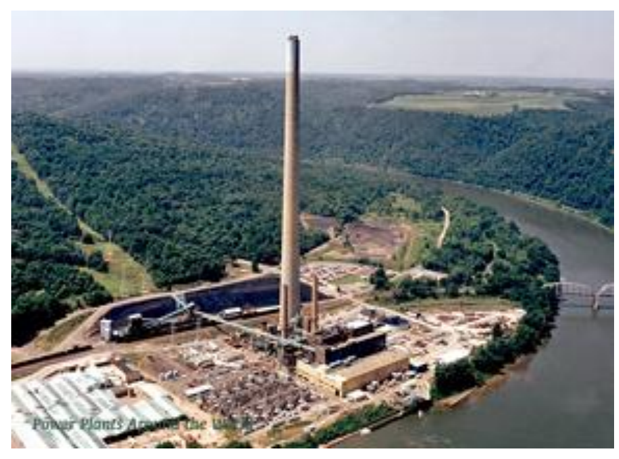
The Armstrong coal plant in Pennsylvania.

How it Works : Coal plants burn coal to make steam. The steam is used to power a type of engine, called a "turbine". This turbine runs a generator to make electricity.