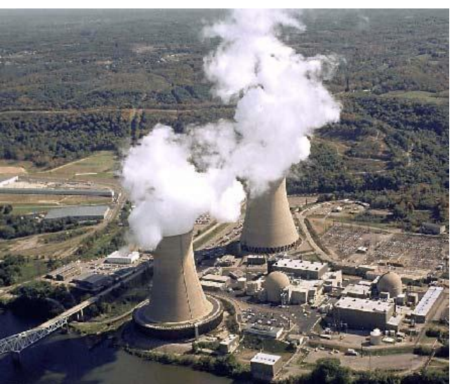
Nuclear plant near Shippingport, PA

How it Works : Nuclear plants use uranium that has been slightly processed, or "enriched". In a nuclear plant, the uranium atoms break apart and release heat that is used to make steam. The steam is used to power a type of engine, called a "turbine". This turbine runs a generator to make electricity. Nuclear plants built in the future will have a more advanced design than existing ones. While existing plants are very safe, the new design is expected to make a nuclear accident virtually impossible.