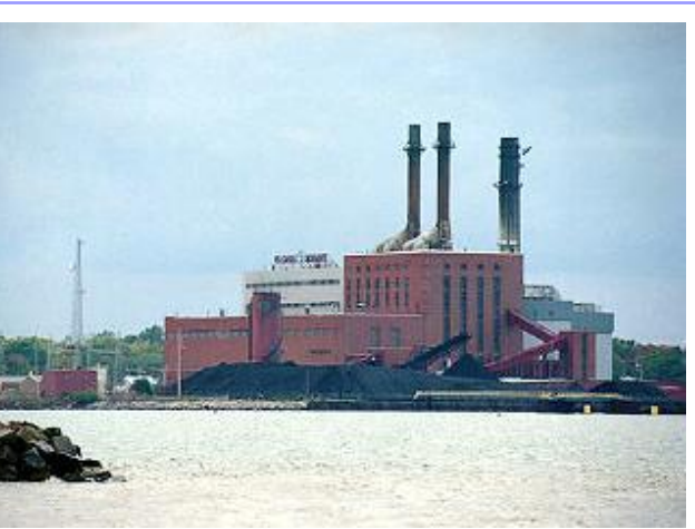
Biomass-coal power plant in Dunkirk, NY

How it Works : This plant is very similar to the one described in "Coal, CO<sub>2</sub> released" . But in this plant, some biomass is mixed in with the coal. Biomass comes from farm crops, paper mills, and wood chips. In these mixed plants, biomass is substituted for 10% of the coal. The coal-biomass mixture is burned to make steam. The steam is used to power a type of engine, called a "turbine". This turbine runs a generator to make electricity.