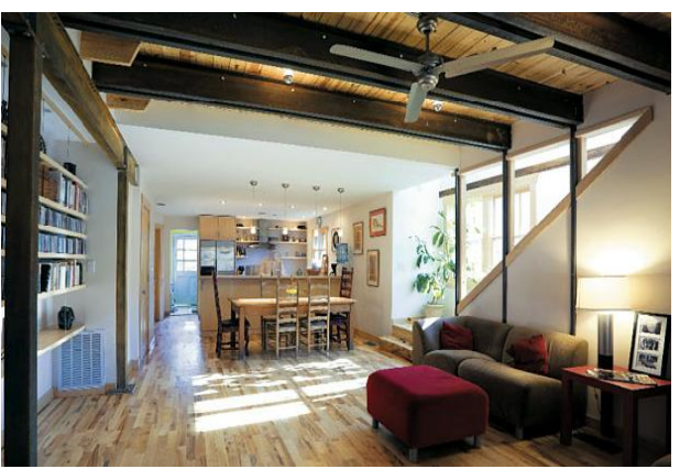
Energy efficient house in North Carolina (renovated rather than newly constructed).

Energy efficiency refers to using more efficient things. For example, people can use more efficient