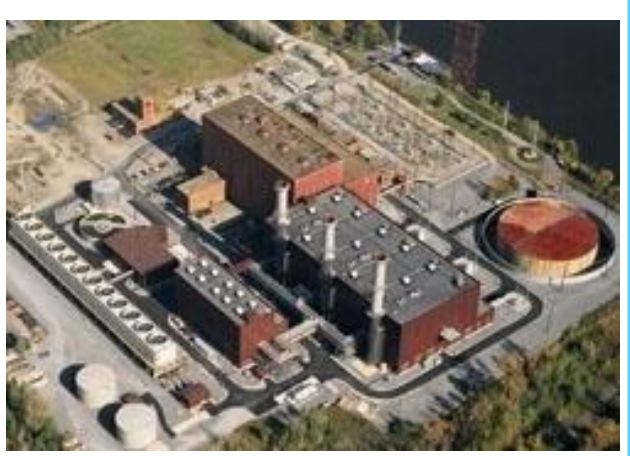
Natural gas plant near Albany, New York.

How it works: Most of the natural gas in western PA is used to heat homes. But, it can also be used in power plants to make electricity. In the plant, natural gas is burned in a type of engine, called a "turbine". This turbine then runs a generator to make electricity. The left-over hot gas is used to make steam. The steam also powers a turbine connected to a second generator to make more electricity. Because it uses two turbines, the plant is more efficient.