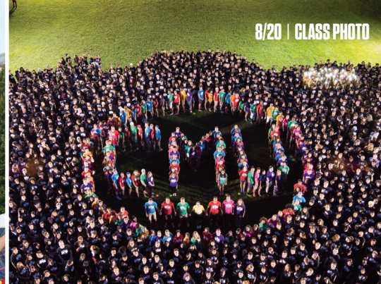
8/20 | CLASS PHOTO