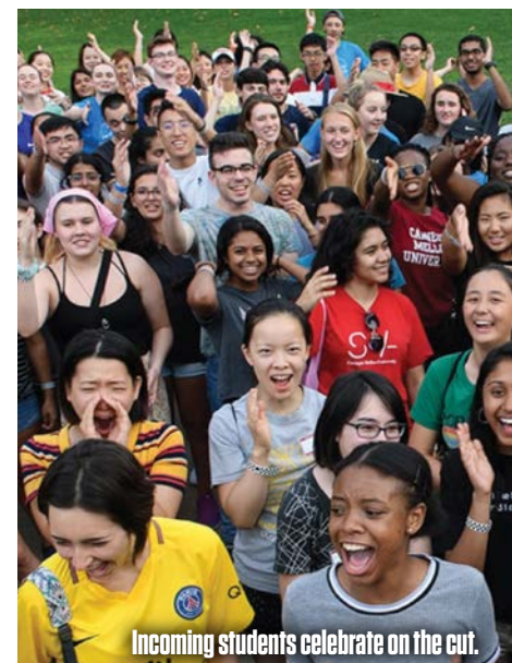
Incoming students celebrate on the cut.