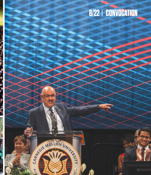
8/22 | CONVOCATION