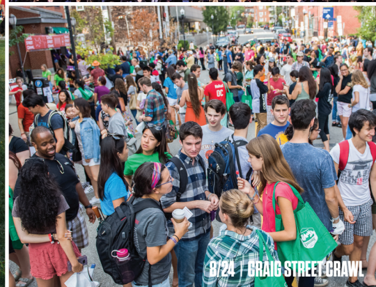
8/24 | CRAIG STREET CRAWL