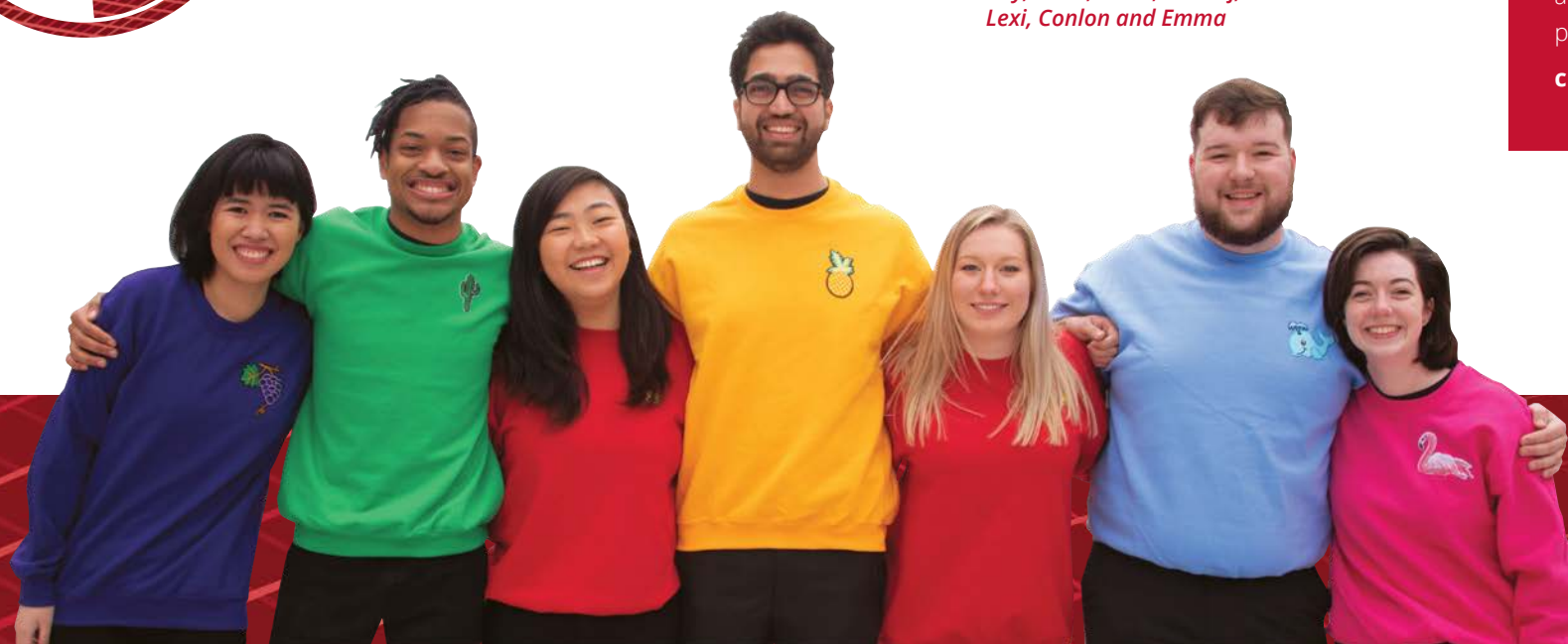
2019 Head Orientation Counselors

Visit the First-Year Orientation website for a list of tasks to complete prior to arriving on campus: cmu.edu/orientation