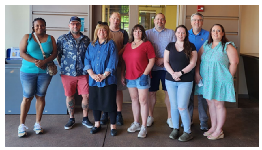
Picture taken at the Celebration of Tartan Testing Program on May 31, 2023.

At its peak, the Tartan Testing program employed 50 operational and 12 laboratory staff, who worked tirelessly to ensure a safe and smooth operation. Thanks to these dedicated individuals, the CMU community had weekly access to asymptomatic testing, and was better protected from the spread of COVID-19.