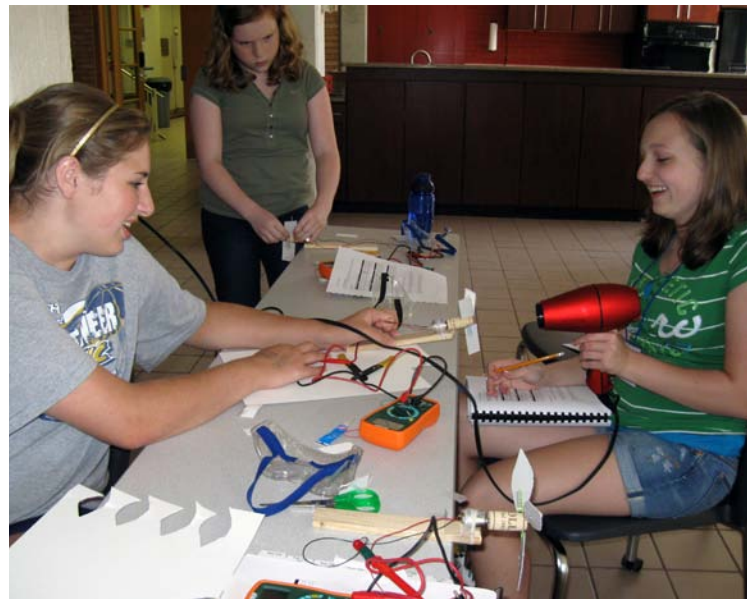
SEE campers try out a new activity

Each participant also creates a research project for herself based on an area of energy that interests her. This summer, girls presented on areas including how geothermal, nuclear, wind, solar and hydroelectric forms of energy work and what are their effects; how green roofs work; and the advantages and disadvantages of renewable resources of energy; to name a few.