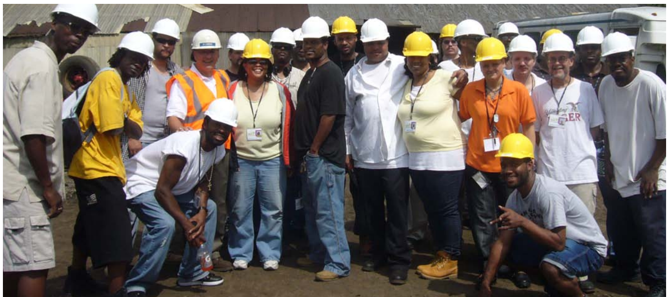
Session 1 trainees assemble after tour of Gulf Materials in Braddock