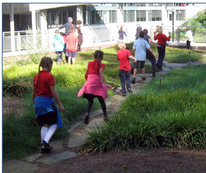
Mt. Lebanon Montessori students on the green roof at Doherty Hall