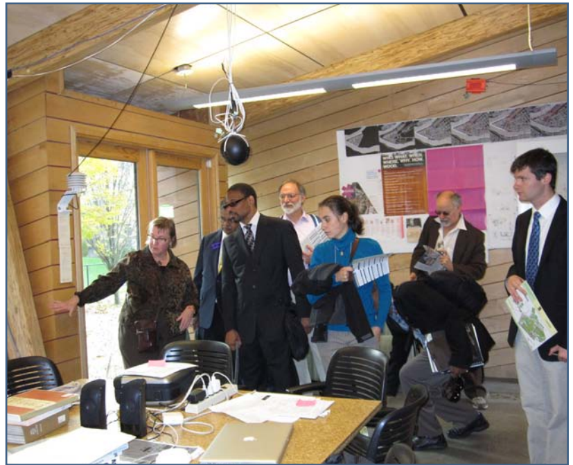
CEREL participants tour the Solar Decathlon House