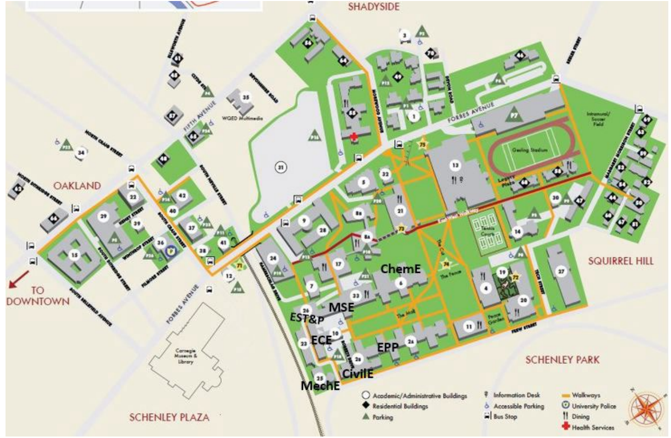
Figure 3. Map of Carnegie Mellon University (see maps of campus for more).