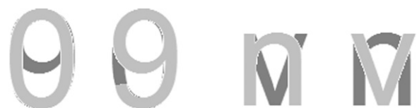
Fig. 2. Illustration of physical overlap (cross-correlation) between symbols. On the left we have overlaid an Arial font '9' (dark grey) on '0', and '0' (dark grey) on '9'; these symbols have a very high cross-correlation of 0.85. On the right an illustration of overlaying 'v' (dark grey) with 'n', and 'n' (dark grey) on 'v', respectively; these two letters have a quite low cross-correlation of 0.37.

There are many ways to compare the image properties of letters and digits – for example, one might count absolute strokes per symbol or the number of curved vs. straight strokes. To avoid making any a priori assumptions on how to carve up the symbols, we computed letter and digit image-based similarity using one of the simplest methods for template matching and similarity estimation: normalized cross-correlation (Lewis, 1995). To do so, we cross-correlated each pair of symbol images, and found the peak of the cross-correlation map, that is, the horizontal/vertical translation of one image with respect to the other that maximizes their alignment. We then recorded the respective correlation coefficient (i.e., degree of overlap between the two images, see Fig. 2a) as an estimate of similarity: the higher the correlation, the more similar the images of the two symbols. This provides an estimate of maximal similarity between two symbols, and the cross-correlation coefficient can be thought of as the worst-case scenario when discrimination of a symbol from its competitors is most difficult. This analysis was done separately for letters and digits displayed in high contrast (black against white background) and it was done for two