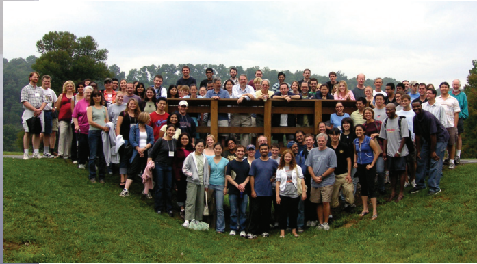
Faculty and Graduate Students at the Annual Stupakoff Departmental Retreat at Camp Kon-O-Kwee

With 2007 coming to a close amid personal and professional resolutions, we're taking stock of the department's triumphs and challenges and anticipating a productive 2008.