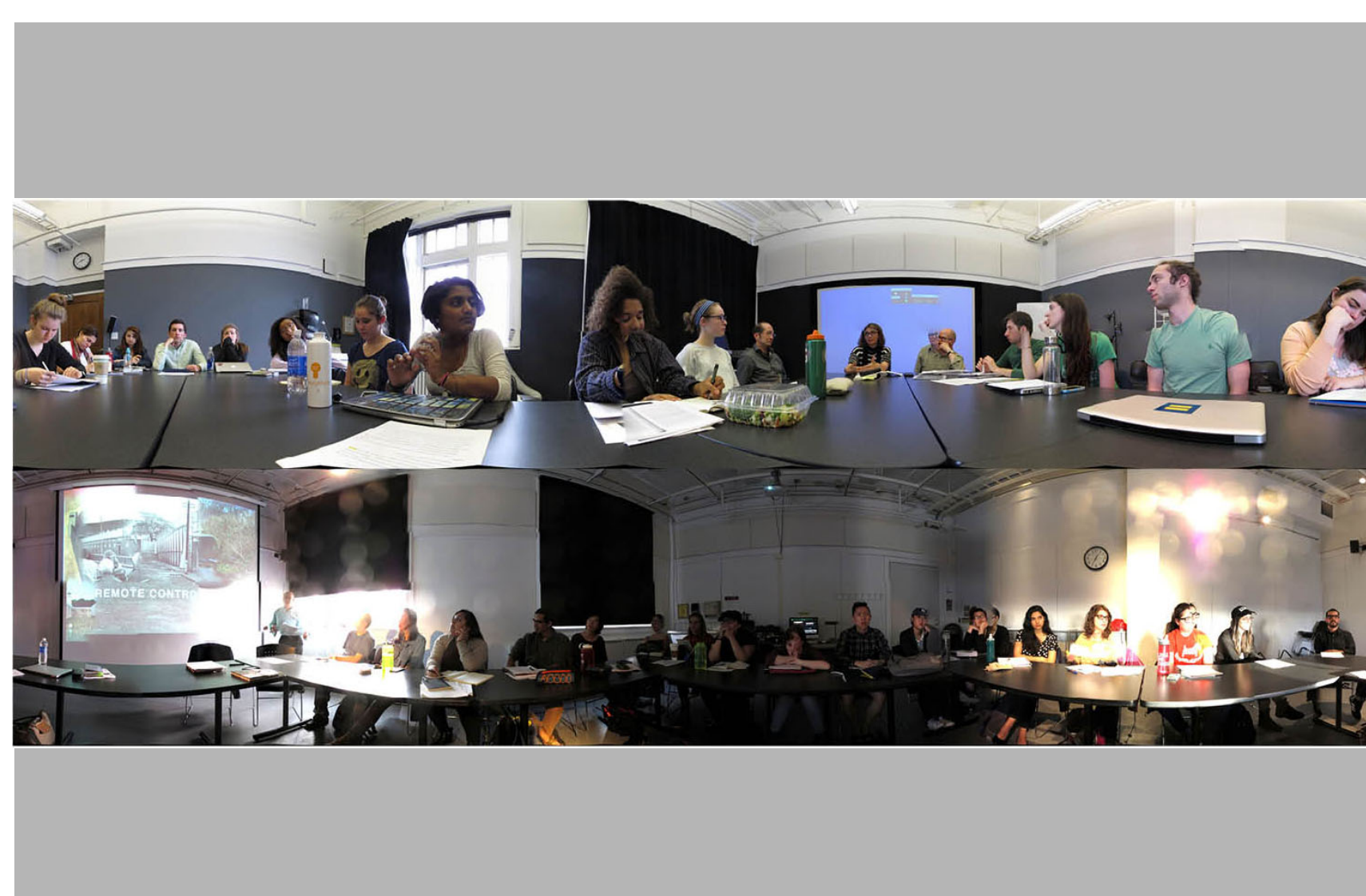
Top: Class in session spring 2015 Bottom: Class in session 2016