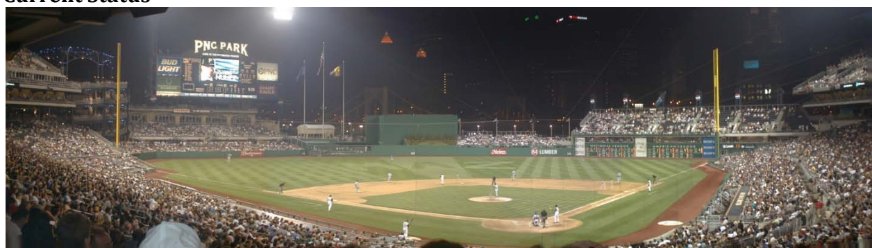
View from inside PNC Park looking South East

PNC Park has been praised by fans and critics alike, ESPN ranked PNC Park as the best stadium in baseball in 2001. Recently ABC News ranked PNC Park as one of the top seven baseball stadiums in the country. Seats at the stadium continue to be affordable and PNC Park is one of only a few stadiums to allow guests to bring their own food.