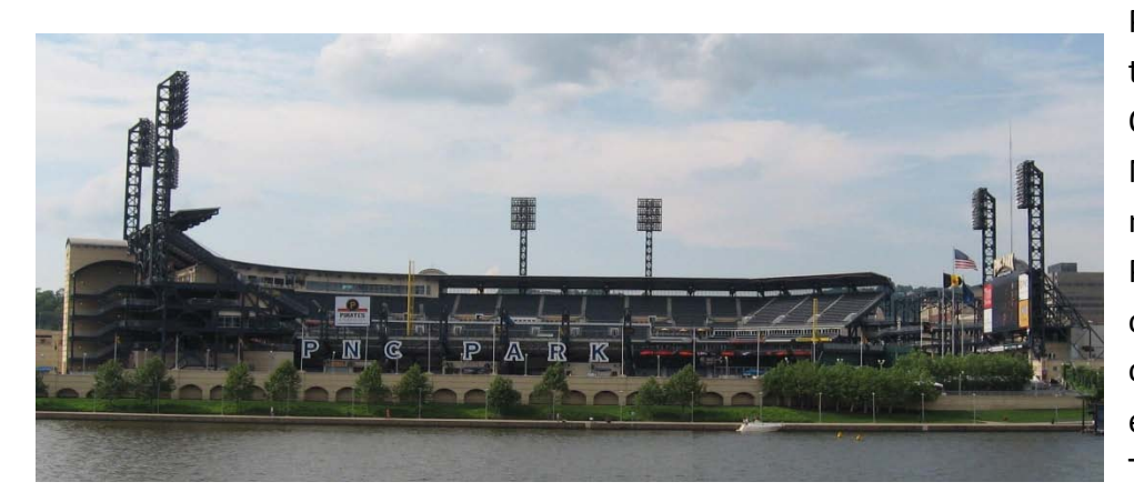
View of PNC Park from the Allegheny River

PNC Park stands on the banks of the Ohio River in the Northside neighborhood of Pittsburgh. It occupies 14.7 acres of riverfront real estate north of the Three Rivers Park Walkway. PNC Park sits between the