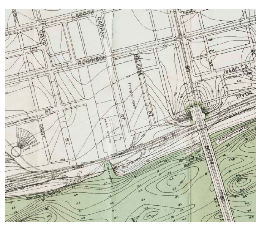
Historical Site of PNC Park from the Report of the Flood commission of Pittsburgh, Pennsylvania in 1912

PNC Park sits on land that began as wetlands formed by the confluence of the Allegheny and Monongahela Rivers. During Pittsburgh's period of industrial growth, these wetlands were progressively converted for industrial use. Previous tenants have included coal gasification plants, railroad yards and steel mills.