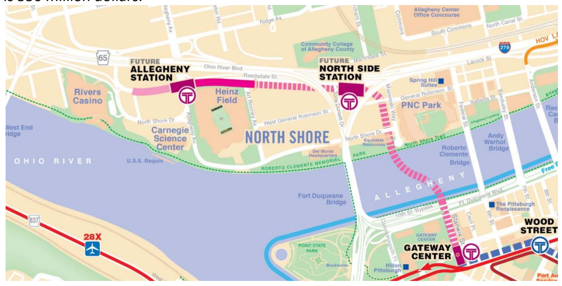
Pittsburgh Port Authority Map of the North Shore Connector Project

As part of Pittsburgh's North Shore Connector project, a light rail extension will be built to provide an alternate way to get to the North Shore area from the city. Allegheny Station will serve to help commuters from Downtown Pittsburgh to PNC Park and PNC Park. This will help ease traffic congestion that has plagued the area. The projected cost of the entire new rail line is 550 million dollars.