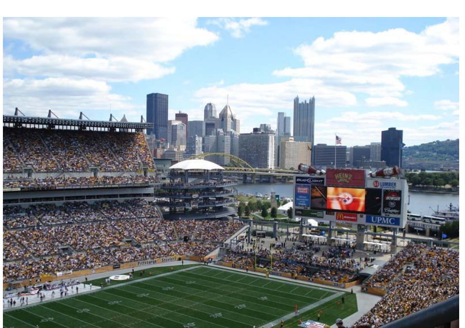
View from inside Heinz Stadium towards the South East