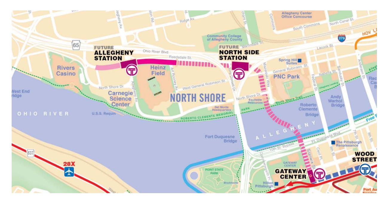
Pittsburgh Port Authority Map of the North Shore Connector Project

As part of Pittsburgh's North Shore Connector project, a light rail extension will be built to provide an alternate way to get to the North Shore area from the city. Allegheny Station will serve to help commuters from Downtown Pittsburgh to PNC Park and Heinz Field. This will help ease traffic congestion that has plagued the area. The projected cost of the entire new rail line is 550 million dollars.