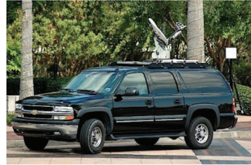
Mobile Communicator Vehicle (MC2): NIMS Type IV (with satellite, VoIP)