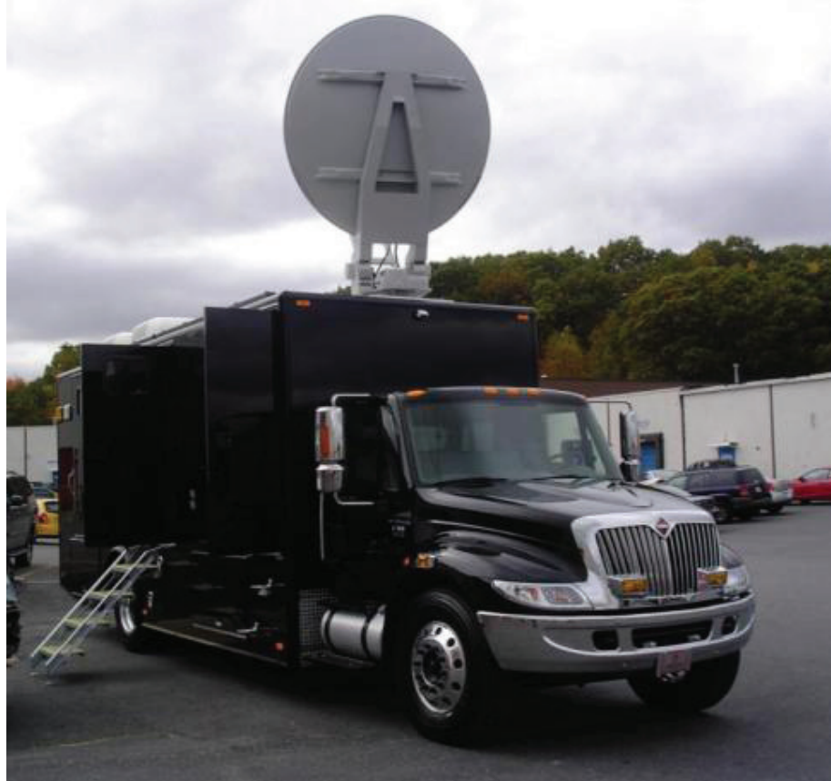
Network Emergency Response Vehicle (NERV): NIMS Type II Mobile Communications Center.