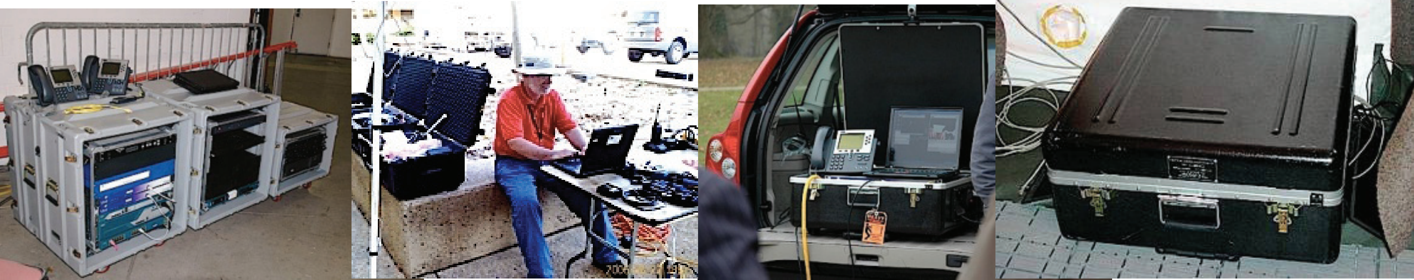
Fogcutter, Tactical Communication and Raptor Kits. Portable, Rapidly Deployable Communications. Easily paired with portable satellite.