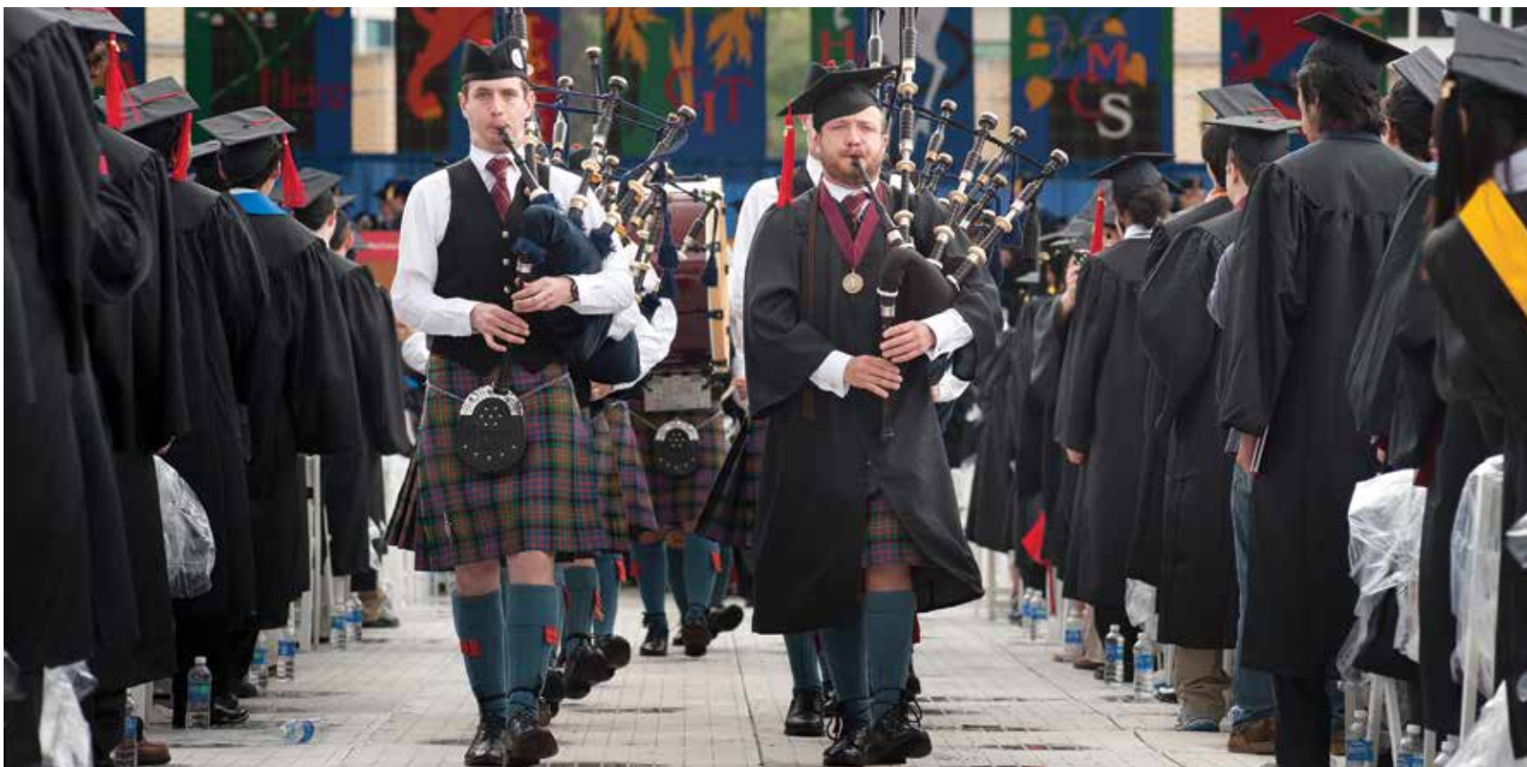
At commencement, the Carnegie Mellon Pipes and Drums Band will lead the procession of faculty and platform group members into Gesling Stadium.

Perlis Atrium, third floor, Newell-Simon Hall