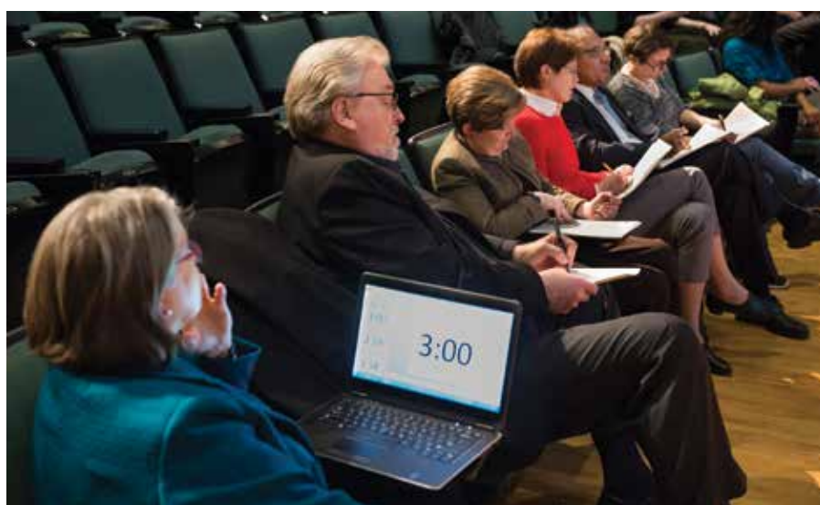
The clock is set as judges take notes on the competitors.

field, but she was grateful for the experience.