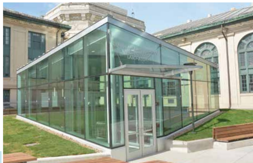
Below: Entrance to the Bertucci Nanotechnology Lab is through a glass pavilion tucked between Porter, Hamerschlag, Roberts and Wean halls.