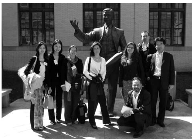
Eight international journalists from Europe and Japan recently visited Carnegie Mellon. The journalists attended several presentations on campus, including robotics and computer science demonstrations. They also visited the Collaborative Innovation Center and the Entertainment Technology Center, where they met Anthony Daniels (C3PO of Star Wars fame).

presence will grow as the university does research with NASA and Valley companies, establishes educational programs, offers special internship and work opportunities to students on the Pittsburgh campus, and develops closer ties with the nearly 3,000 alumni who live and work in the Valley. For more information about the university's Silicon Valley programs, see http://west.cmu.edu .