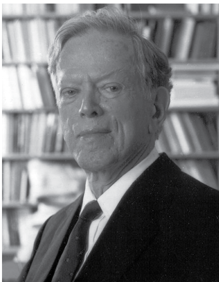
PATRICK COLONEL SUPPES

Suppes is the Lucie Stern Professor of Philosophy, Emeritus, at Stanford University, where he was director of the Institute for Mathematical Studies in the Social Sciences. He has made significant contributions to many fields of science, and has explored such diverse areas as the foundations of physics, the theories of measurement, decision theory, the foundations of probability and causality, the foundations of psychology, the philosophy of language, education and computers, and philosophy and science. He was president of the National Academy of Education and he is a member of a number of international and national professional societies. Suppes is a recipient of numerous awards for his contributions in education and science.