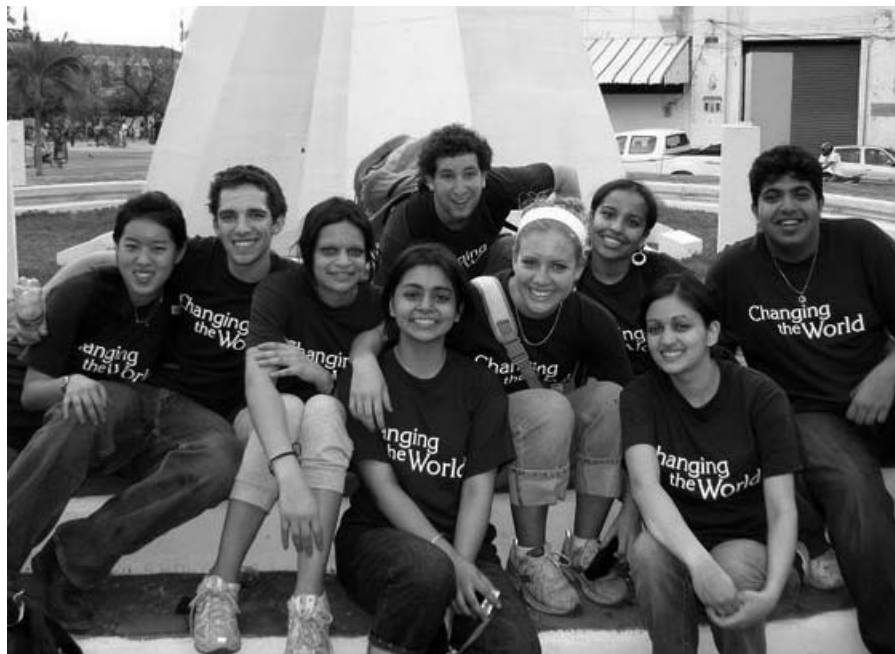
STUDENTS IN FREE ENTERPRISE SPENT THEIR SPRING BREAK IN NICARAGUA, WHERE THEY HELPED A FAMILY AND LOCAL BUSINESSES. IN THEIR FREE TIME THEY EXPLORED THE COUNTRY AND ITS CULTURE.