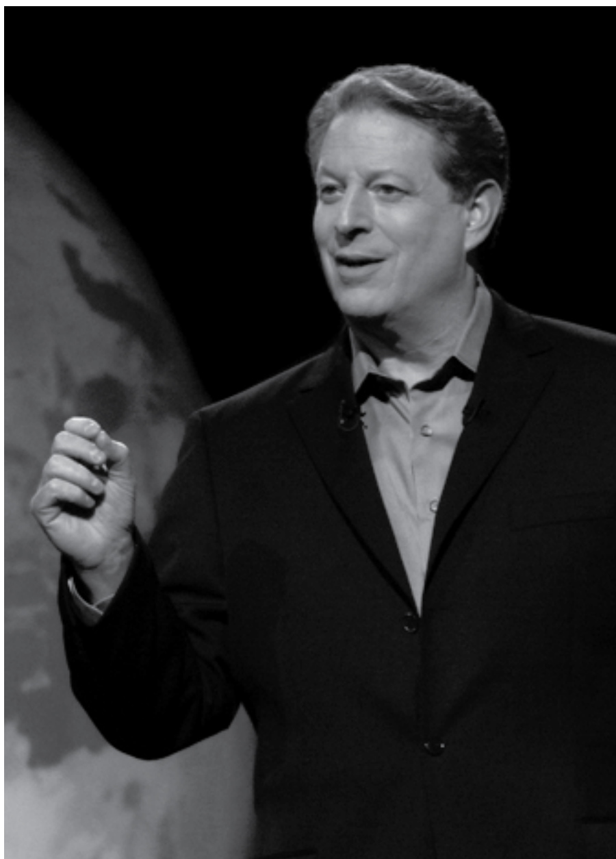
AL GORE AND THE INTERGOVERNMENTAL PANEL ON CLIMATE CHANGE WERE WINNERS OF THE 2007 NOBEL PEACE PRIZE FOR “INFORMING THE WORLD OF THE DANGERS POSED BY CLIMATE CHANGE.”

Gore was elected to the U.S. House of Representatives in 1976, 1978, 1980