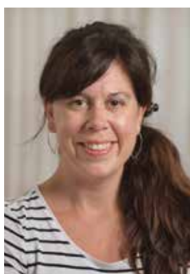
ERIKA NINOS INSTITUTE FOR COMPLEX ENGINEERED SYSTEMS