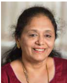
SUMITRA GOPAL ROBOTICS INSTITUTE