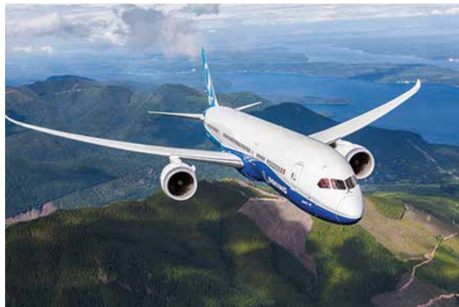
INSIGHTS GLEANED FROM THE NEW BOEING/CARNEGIE MELLON AEROSPACE DATA ANALYTICS LAB COULD LEAD TO SAFER, MORE RELIABLE AND MORE EFFICIENT AIRCRAFT OPERATIONS.

Boeing-directed projects have been identified. CMU anticipates the Boeing lab will involve at least 20 faculty and graduate student researchers.