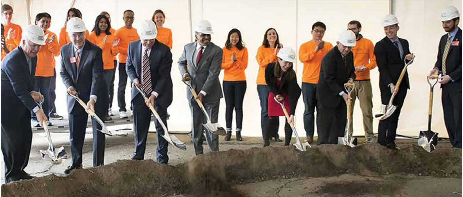
SHOVELS HIT THE DIRT FOR THE CEREMONIAL GROUNDBREAKING.