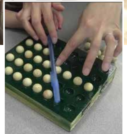
RESEARCHERS ARE USING A REPURPOSED BINGO TRAY TO KID-TEST A MATHEMATICAL CONCEPT AT CMU'S CHILDREN'S SCHOOL.

In anticipation of making the finals and mounting a field test in East Africa, the team already is working with experts