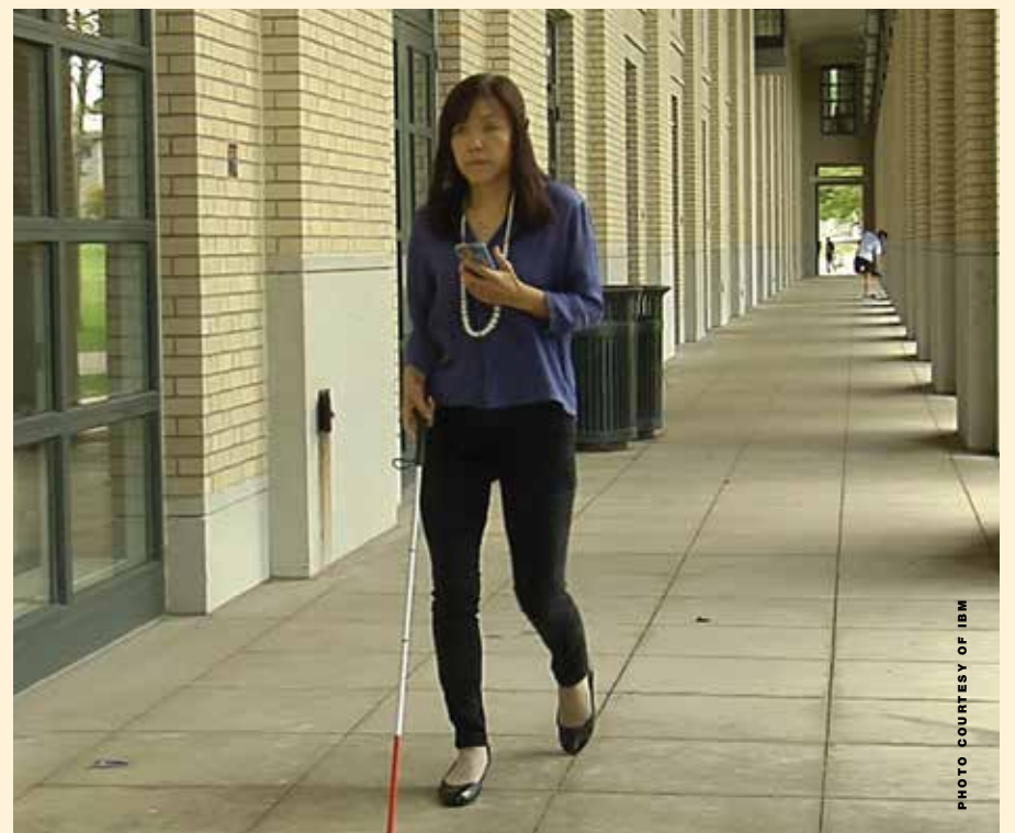
IBM FELLOW AND VISITING CMU FACULTY MEMBER CHIEKO ASAKAWA USES A NEW APP FOR THE BLIND TO NAVIGATE AROUND CAMPUS.

The first set of cognitive assistance tools for developers is now available via the cloud through IBM Bluemix. The open toolkit consists of an app for navigation, a map editing tool and localization algorithms that can help the blind identify in real time where they are, which direction they are facing and additional surrounding environmental information. The computer vision navigation application tool turns smartphone images of the surrounding environment into a 3-D space model to help improve localization and naviga-