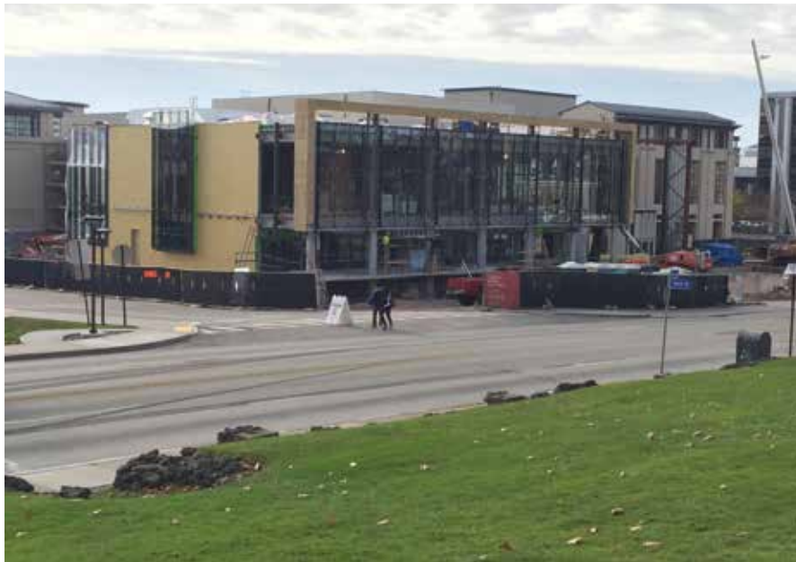
THE COHON CENTER ADDITION WILL BE COMPLETED THIS MAY.

Also nearing completion is the Hamburg Hall renovation project. A new 150-seat auditorium, modeled after Rashid Auditorium in the Hillman Center, has been constructed between Smith and Hamburg halls and an ADA-compliant Forbes Avenue entrance has recently opened. The auditorium was completed for the start of classes this past August.