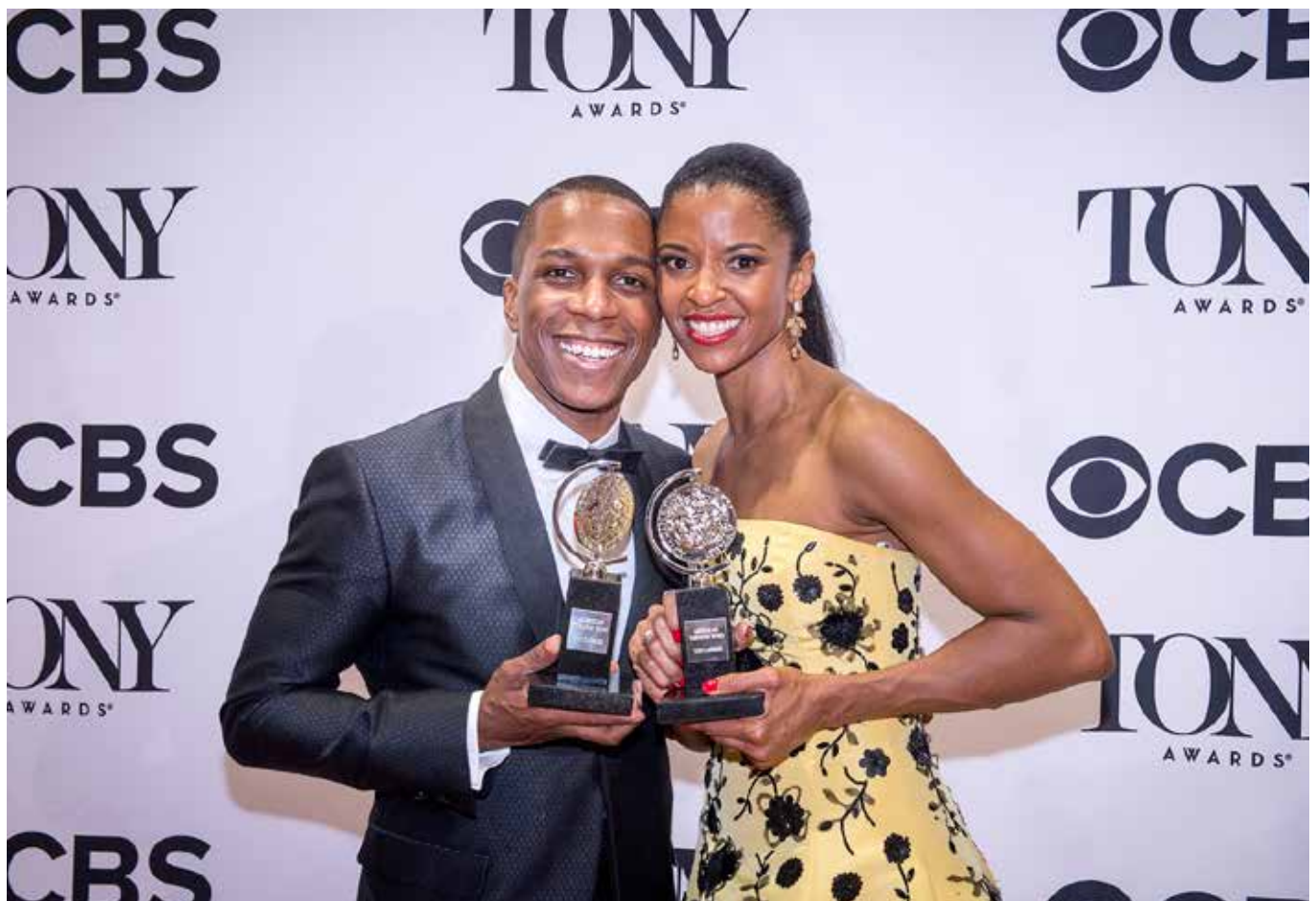
CMU alumni Renée Elise Goldsberry and Leslie Odom Jr. took home Tony Awards this year for their outstanding performances in the hit Broadway musical "Hamilton." Read the story on page two.