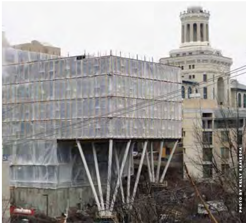
SCOTT HALL IS SCHEDULED FOR COMPLETION BY JANUARY 2016.

Through a series of exterior and interior ramps, pedestrian bridges, stairways and hallways, Scott Hall