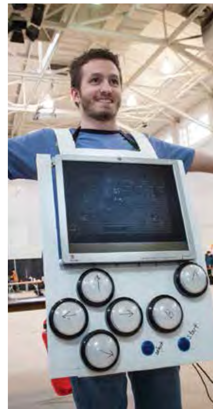
THE CREATIVE ENGINEERING PROJECTS FEATURED AT THE BUILD18 TINKERING FESTIVAL INCLUDED (CLOCKWISE FROM BOTTOM):