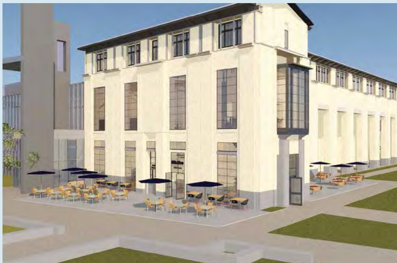
THE ABOVE RENDERINGS SHOW THE PROPOSED DESIGNS FOR THE UNDERGROUND (TOP) AND THE GROUND FLOOR CAFÉ AT THE CUC.

floor café and renovation to Skibo Café will add more than 300 dining seats to the CUC, including those outdoors.