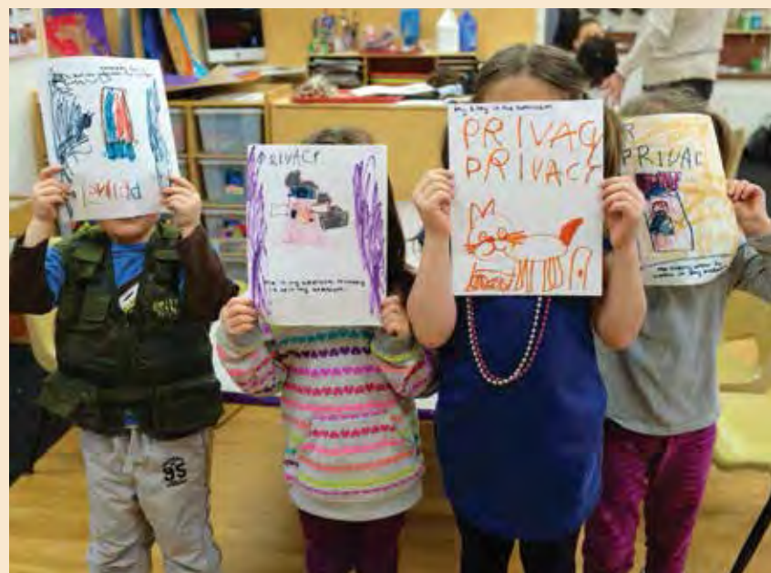
WHAT DOES PRIVACY MEAN TO YOU? THE PROJECT, PRIVACY ILLUSTRATED, HAS AMASSED HUNDREDS OF DRAWINGS FROM CHILDREN AND ADULTS.

Visitors to the Privacy Illustrated website, http://cups.cs.cmu.edu/privacyillustrated/ , can explore the drawings in random order or via keywords.