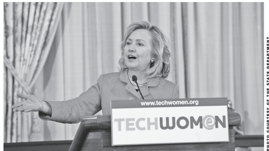
U.S. SECRETARY OF STATE HILLARY RODHAM CLINTON DELIVERS REMARKS AT A CLOSING LUNCHEON FOR THE TECHWOMEN INITIATIVE IN WASHINGTON, D.C.

The Silicon Valley campus hosted a reception for the mentees to meet faculty and other students, discuss their research interests and explore possible future collaborations.