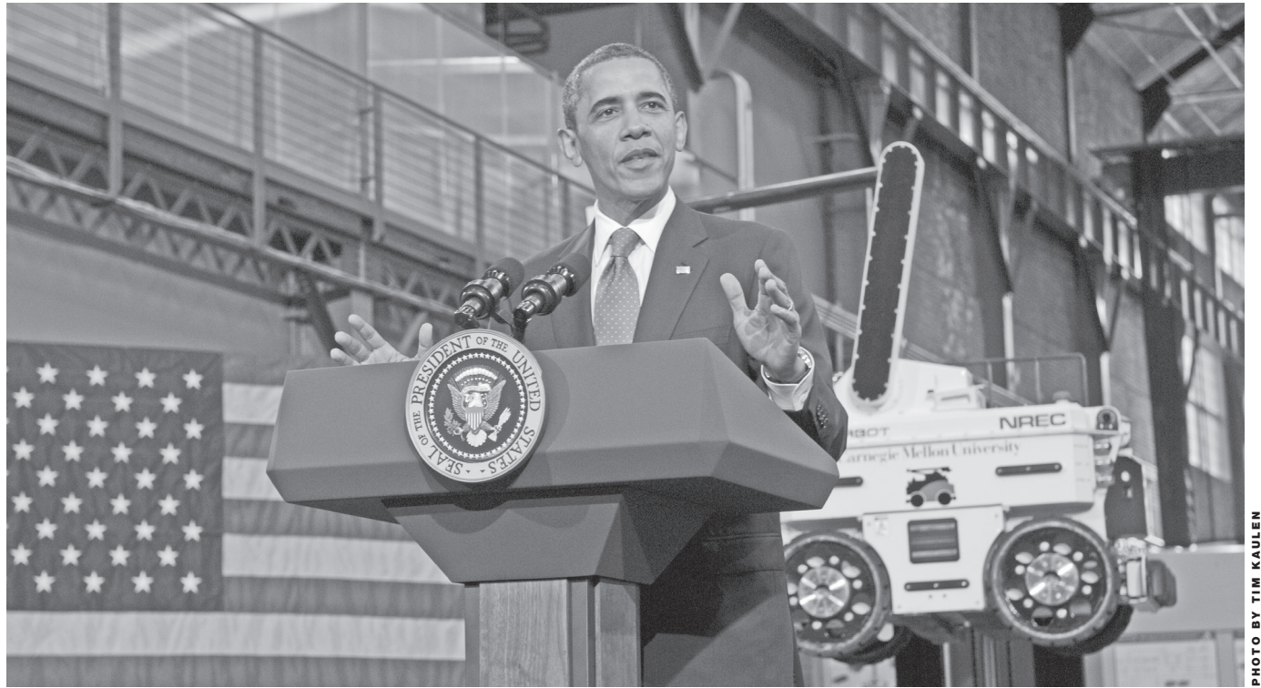
PRESIDENT BARACK OBAMA HIGHLIGHTED THE IMPORTANCE OF MANUFACTURING IN THE U.S. ECONOMY AT THE NREC IN JUNE.

This was Obama's third trip to Carnegie Mellon, all of which have occurred in June. He visited in 2010 for an address in Wiegand Gymnasium on the economy. In 2008, then Sen. Obama spoke and hosted a summit at CMU on ensuring United States' competitiveness in the global economy. The summit brought together economic, educational, community-based and industry leaders to discuss the challenges facing the workforce and to craft solutions for the 21st century.