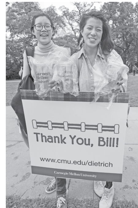
IN PITTSBURGH, STUDENTS CELEBRATED WITH THE ACTIVITIES FAIR, A CONCERT AND FIREWORKS.

"In the last year alone, our students have won many scholarships, including coveted Fulbright, Luce and German Chancellor awards. And, H&SS faculty members won a National Book Award, a Global Award for Entrepreneurship Research, often referred to as the 'Nobel Prize for Entrepreneurship' and a Benjamin Franklin Medal in Cognitive and Computer Science," he said. "This rich combination of faculty and student talent guarantees that the Dietrich College will be a major contributor to the important research accomplishments with huge societal impact being produced by Carnegie Mellon faculty."