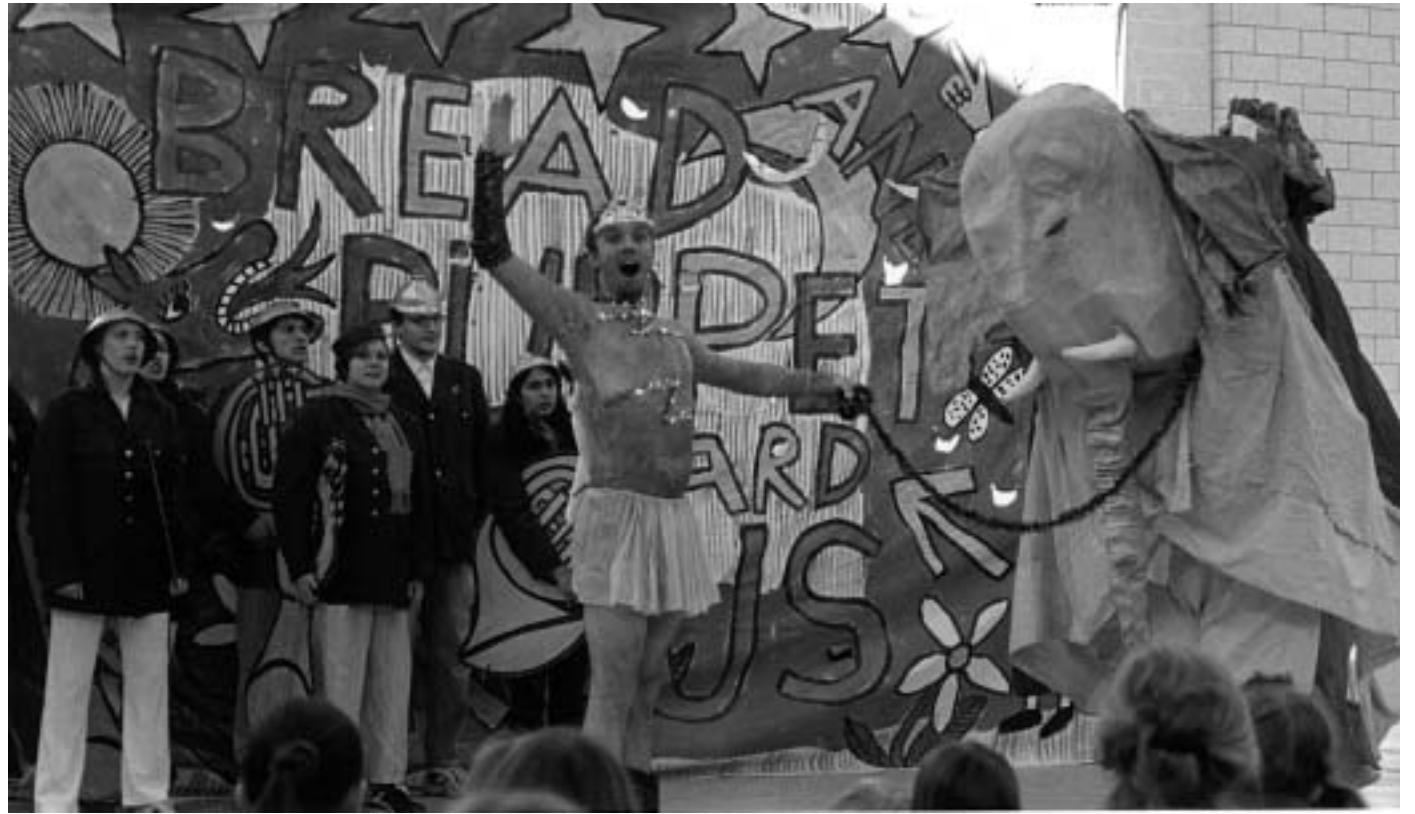
The ringmaster of the Bread and Puppet Theater introduces the Economy—played by a pink elephant

The fine print warning on the posters advertising the Bread and Puppet Theater said "Suited for (not totally conservative) families." There were many parents with children listening to political and at times adult material. In one recurring skit, a cast member with the aid of a cartoon strip narrated the life of Solomon Grundy, a proletarian worker who started his week on Monday and "was no more" by Sunday.