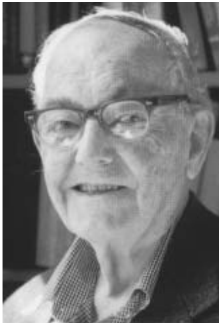
Herbert A. Simon