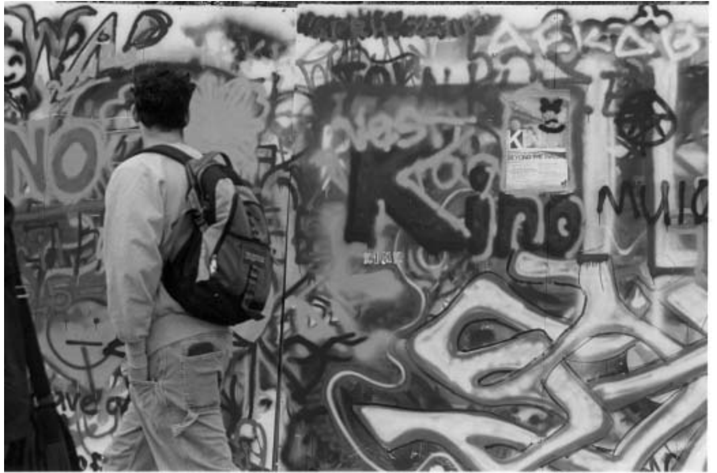
The Berlin Wall rose again this spring along the sidewalk near Doherty Hall

The festival was also expecting an appearance by cinematographer Michael Ballhaus, who has worked on dozens of American films including "The Legend of Bagger Vance," "Air Force One," "Goodfellas" and "The Last Temptation of