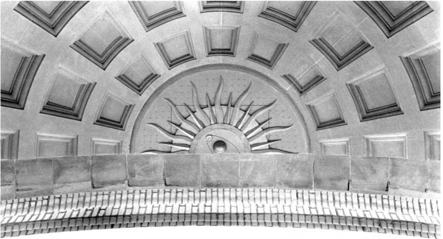
Despite iffy weather this spring, the sun shone bright every day over the entrance to the Fine Arts Building