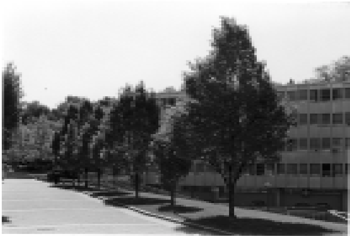
Some trees along Donner ditch are stunted compared to their well-watered cousins by Resnik and West Wing.

Below: Oaks near Hunt Library drop their leaves due to an iron deficiency