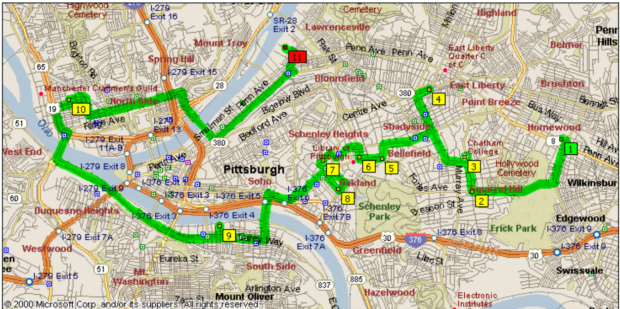
Figure 2 Collection Map