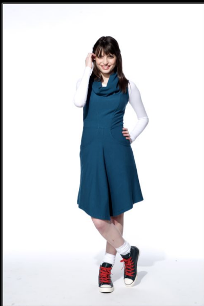
★★★★★ ISO 250 f/10 1/160 0 ev 70mm Focal Length (35mm): 70.0mm Lens: AF-S 200mm-Micro 24-70mm F2.8 ED Maximun Number PWD: 6175 Pixels: 1111x1 19.0x19.0 DLS-ECT. Elec. Shutter: 1/160 1/80