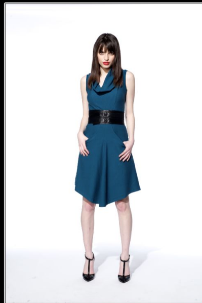
★★★★★ ISO 250 f/10 1/160 0 ev 70mm Focal Length (35mm): 70.0mm Lens: AF-S 200mm-Micro 24-70mm F2.8 ED Maximun Number PWD: 6098 Pixels: 1111x1 19.0x19.0 DLS-ECT. Elec. Shutter: 1/160 1/80