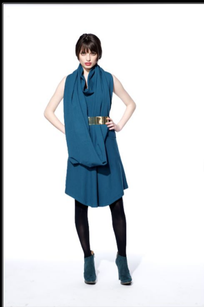
★★★★★ ISO 250 f/10 1/160 0 ev 70mm Focal Length (35mm): 70.0mm Lens: AF-S 200mm-Micro 24-70mm F2.8 ED Maximun Number PWD: 6076 Pixels: 1111x1 19.0x19.0 DLS-ECT. Elec. Shutter: 1/160 1/80