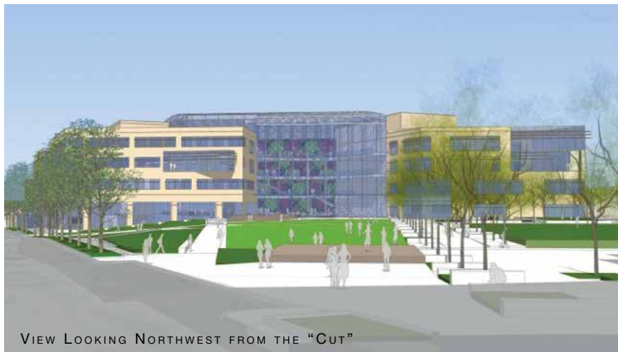
VIEW LOOKING NORTHWEST FROM THE “CUT”

“We hope people come over to collaborate on research and education, for social reasons, to eat, to workout. We want them to come and never leave,” he said.