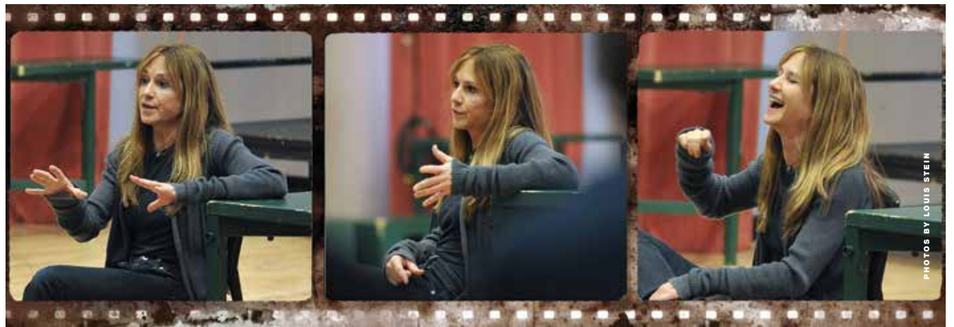
ACADEMY AWARD-WINNING ACTRESS AND SCHOOL OF DRAMA ALUMNA HOLLY HUNTER DISCUSSES HER CRAFT, HER CMU TRAINING AND HER CAREER TRAJECTORY WITH DRAMA STUDENTS.

“Going to school at Carnegie [Mellon] gave me incredible confidence and a sense of entitlement to act, which was a total advantage when I went to New York to start my career,” Hunter said in a southern accent punctuated by several decades of life in the Big Apple. “You leave here knowing how to work. You’re confident; training here gives you an orientation to yourself — almost like