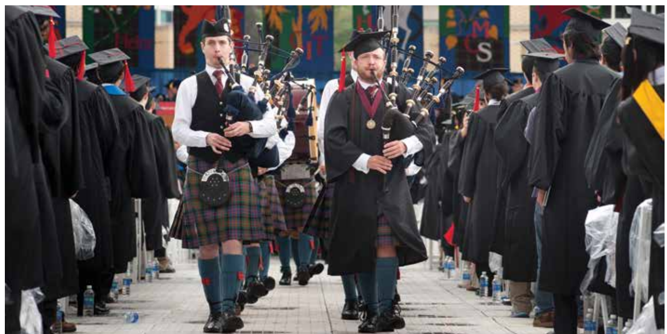
AT COMMENCEMENT, THE CARNEGIE MELLON PIPES AND DRUMS BAND WILL LEAD THE PROCESSION OF FACULTY AND PLATFORM GROUP MEMBERS INTO GESLING STADIUM.