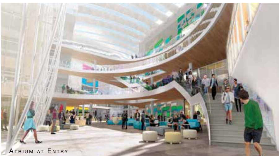
ATRIUM AT ENTRY