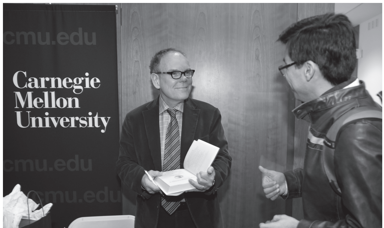
AUTHOR DON TAPSCOTT VISITED CMU TO DISCUSS THE DIGITAL AGE.

Don Tapscott, author and business management expert, recently visited Carnegie Mellon to talk about his latest book, "Macrowikinomics," in the second of the university's Innovators Forum series. Watch his talk online at cmu.edu/piper .