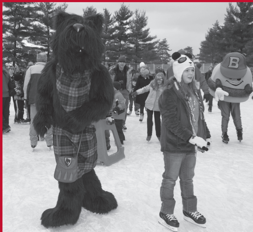
CARNEGIE MELLON’S MASCOT, WHICH RECENTLY RANKED 10TH IN NBC’S MASCOT POWER RANKINGS, JOINED 29 OTHER COSTUMED CHARACTERS ON THE ICE AT THE SCHENLEY PARK SKATING RINK ON SATURDAY, JAN. 14. THE EVENT, IN ITS 25TH YEAR, DREW MORE THAN 500 SKATERS.