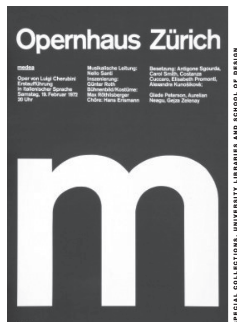
A POSTER BY RUEDI RÜEGG ANNOUNCING A PERFORMANCE OF “MEDEA,” IS PART OF THE UNIVERSITY’S SWISS POSTER COLLECTION. RÜEGG DONATED 500 POSTERS, WHICH WERE CITED BY THE SWISS GOVERNMENT AS EXCELLENT EXAMPLES OF GOOD DESIGN.

“In the ’60s and beyond, Swiss graphic design to many American designers looked well-organized, well-